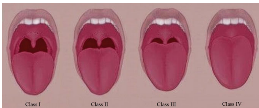
Fig. 2.1 Schematic classification of the pharyngeal structures based on Samsoon and Young's modification of the original Mallampati classification