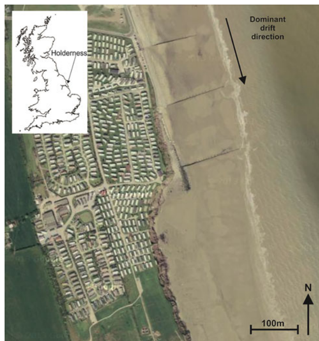
Fig. 2.1 Aerial view of the set-back downdrift of the defence works at Hornsea on the Holderness coast of Yorkshire, UK, where a 1,544 m groyne field was extended by 290 m (including a small shore parallel extension). The inset map shows the location of the Holderness coast

The value of the maintained recession is taken from a sufficiently long time period leading up to, and not after, the construction commenced. It is important that the maintained value covers a time period sufficiently long to obtain a full representation of all the “current” factors influencing the rate of erosion as listed above. The historical factors should be excluded unless there are reasons to consider they may still be active and likewise the long term factors can be also be excluded where over the time period selected, their influence is very small. The exact length of the time period will depend on the dates of available data and its