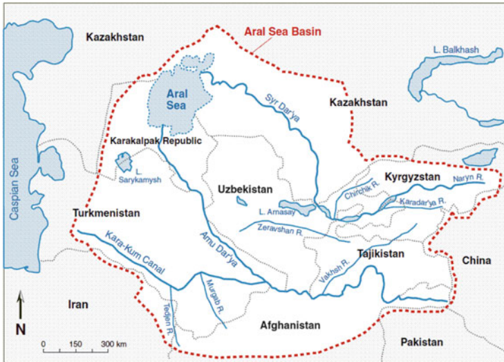
Fig. 2.2 Location of Aral Sea Basin in Central Asia

A variety of soils are found here: serozem (desert), gray-brown desert, meadow, alluvial, sand, takyr (clay) and heavily salinized (Solonets and Solonchak in Russian) (Atlas of the USSR 1983, p. 104). These soils, with the exception of the heavily salinized, can be made agriculturally productive with irrigation. The area that could benefit from irrigation in the Aral Sea Basin has been estimated in excess of 50 million ha (Legostayev 1986), but this is likely a considerable exaggeration.