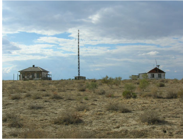
Fig. 2.9 Abandoned Hydrometeorological Station on the Eastern end of the former Barsakelmes Island in August 2005