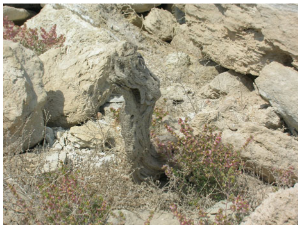
Fig. 2.7 Preserved stump of late Medieval Sauksaul ( Halyoxen apphyllium ) near shore of the Western Basin of the Large Aral Sea (September 2005; photo by P. Micklin)

level much below 40 m. The most important contribution of the CLIMAN efforts is reliably establishing the maximum transgression of the Aral at no more than 58 m asl and probably no higher than 55 m and establishing that the thirteenth to fifteenth century recession was much deeper than previously thought. The CLIMAN group also uncovered a previously unknown recession dating to the Bronze Age (4,000–3,000 B.P.) when the lake's level fell to 42–43 m.