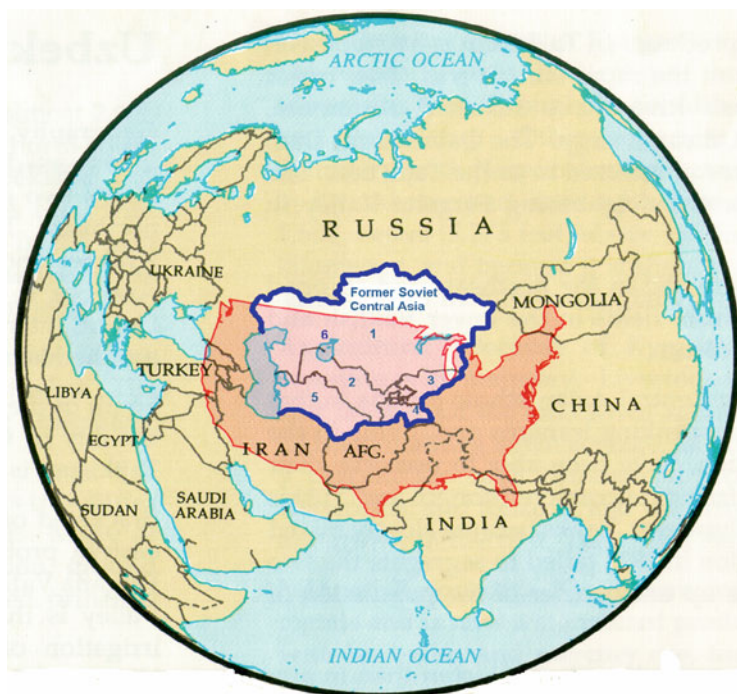
Fig. 2.1 The location of the Former Soviet Central Asia in Eurasia (the outline of the United States is shown for size comparison). Numbers indicate: 1. Kazakhstan, 2. Uzbekistan, 3. Kyrgyzstan, 4. Tajikistan, 5. Turkmenistan, 6. Aral Sea (Source: U.S. Dept. of State. "The New States of Central Asia," INR/GE, 2351, 1993)

temperature averages range from -12^{\circ}\text{C} on the north to slightly above 0^{\circ}\text{C} on the south. July averages run from 24^{\circ}\text{C} on the north to more than 32^{\circ}\text{C} on the south (Atlas of the USSR 1983, p. 99).