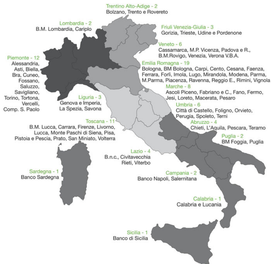
Fig. 2.2 Geographic distribution of Italian bank foundations ( http://www.acri.it )

In the north of the country, 47 foundations are in operation, with net assets of more than €31 billion (74.7 % of the total). Among them, the large-sized foundations have more than half of the total net assets (€31,077 million of the €42,183 million). In the northwest region, the average net assets are more than twice the average