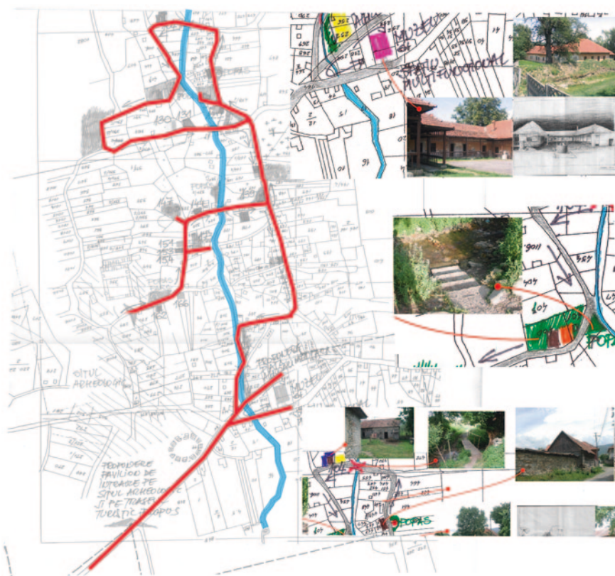
Fig. 7 Route Sarmizegetusa ( source author and Ochinciuc 2006) Part of the proposal for a cultural route and remodelling rural that cross the village and reveals its local value. The proposal relates to architectural, environmental and compatibility, as well as the complexity of implementing a social sustainability

community's life. The landscape is defined, in the minds of Jackson (1984), as "a composition of spaces created or modified by man to provide infrastructure or (the background) of our collective existence". The cell spaces, along the path, (different types of landscape) are reserved for operations that are part of a participatory discourse, according to their form and purpose, of a language because "the landscape is a place of conflict, the place of a permanent compromise between what it is established by the authority and dynamics of the vernacular" (Jackson 1984).