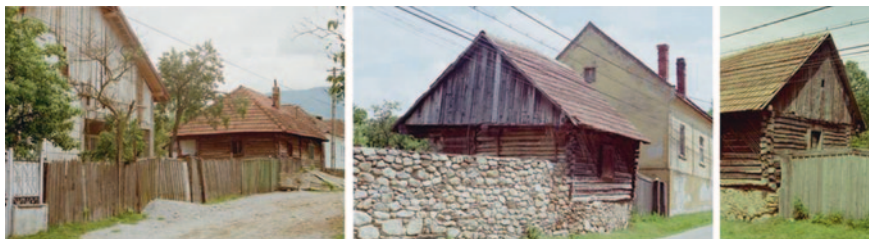
Fig. 6 Sarmizegetusa Ulpia Traiana. Almost 60 % of the fences are actually stone walls of the annex buildings, which seem to have lost today, their former function. Minor interventions such as moving the gate beyond the annexes and allowing the access towards the kitchen trough the side wall, would make an urban socket Ochinciuc (2006), pretext for the access in the building

Navigating the village along the inhabited space of the village tries to steer the tourist towards the common areas that include both private and public spaces. It is desired to combine these spaces, using the means of space reconfiguring, the insertion of new features, the spatial change, the insertion of new features, changing the public image and a strategy for sustainable development. In addition, transforming the old spaces by using a new spatial and temporal expression represents a cultural and identity evolution. These spaces will not be opened or radically changed. On the contrary, the interventions will be local and punctual, giving birth to new spaces and equipments of new points of interest related to high social attractiveness. The choice of materials will also contribute to the creation of a place of history, science, action and contemplation.