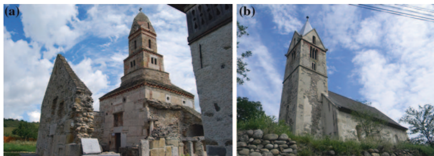
Fig. 3 a The Densuș church. b Santamaria Orlea church

of Litovoi, as certified by the famous Diploma Cavalerilor Ioaniti from 2nd June 1247, by which the Ioaniti Knights receive parts from the country of Litovoi, except the country of “Harzszoc”. This domain fit into a much wider one, which later became Țara Românească, as it was kept in the people’s consciousness that Negru Vodă was born in Hațeg from where he went to south.