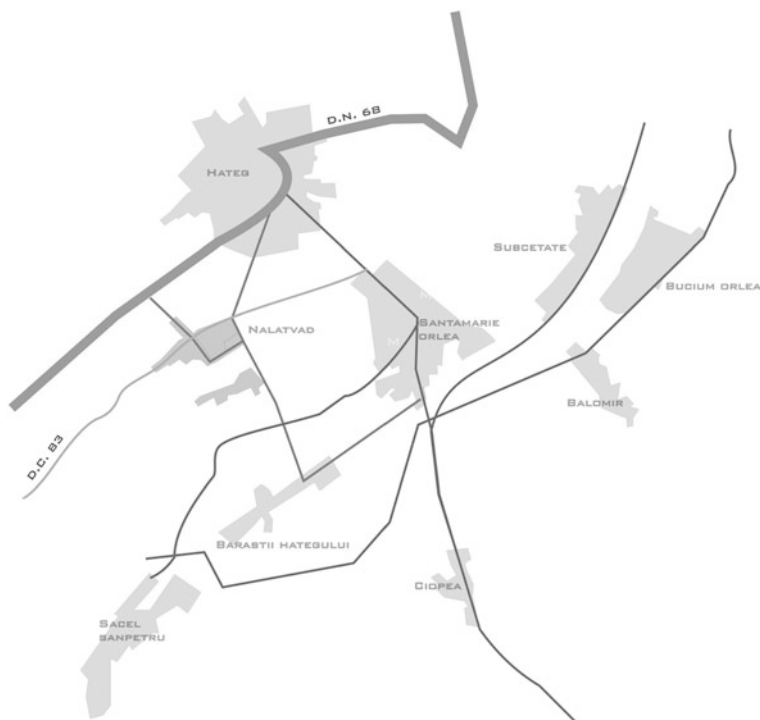
Fig. 4 Typologies of rural settlements in Țara Hațegului ( source author)

place found outside, the duties and the space of the productive activities of the people (Cucu 1981, quote by Vert 2002). The village has its origins in prehistory, the appearance as human groups. It has a continuous inside with different typologies: some geometric rectangular areas, areas organized around some markets, then irregular and deformed areas, as a result of the morphology of the landscape and infrastructure.