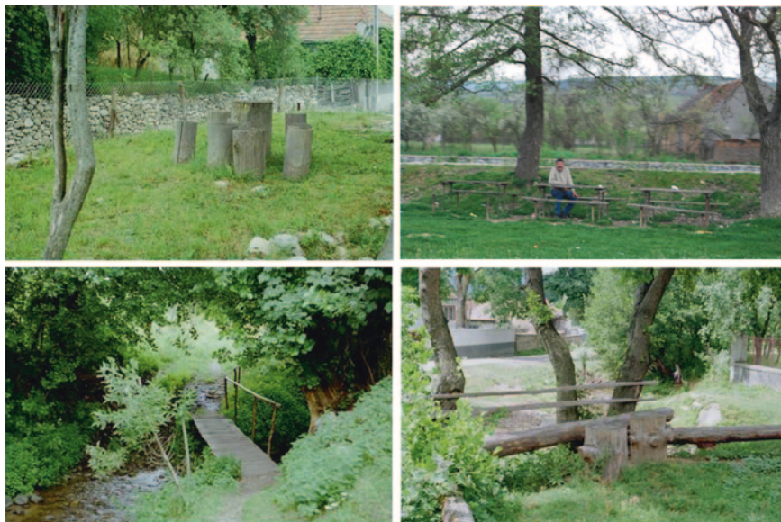
Fig. 5 Rural public spaces

perceived, over the customary practices (and through its vernacularism), and it is experienced as it is symbolized; it bears within itself the daily and power signs”.