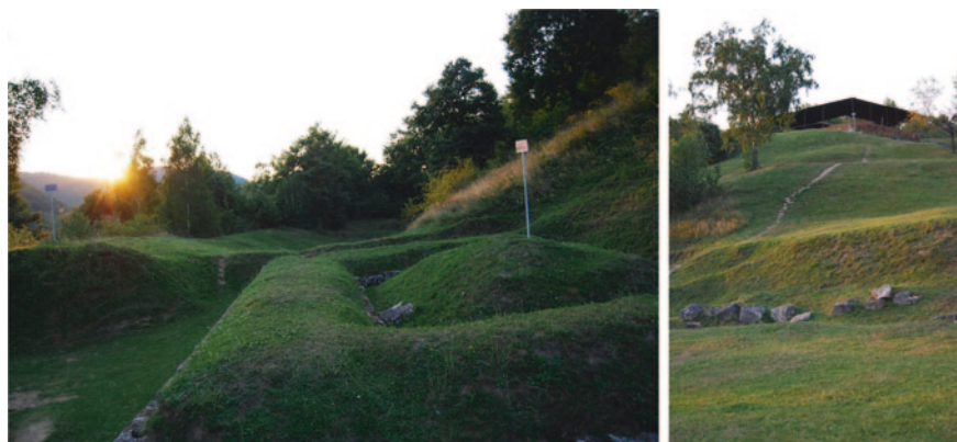
Fig. 2 The Dacian Costesti Citadel 101–102 i.Hr

and monasteries, memory and identity places. Today, as the signs of time, these memory places carry the past in our daily lives, and they become the base for our cultural collective memory. From the man who lived in caves (Ohaba-Ponor, Cioclovina), where there were found polished objects from the Dacian era and kept at Blidaru, Costești and Gradiștea Muncelului (Fig. 2), continuing with the ethno genesis of the Romanian people (Daco-Romans), to the old socio-political compositions of the Middle Ages, every era put its mark on this ancient Romanian hearth.