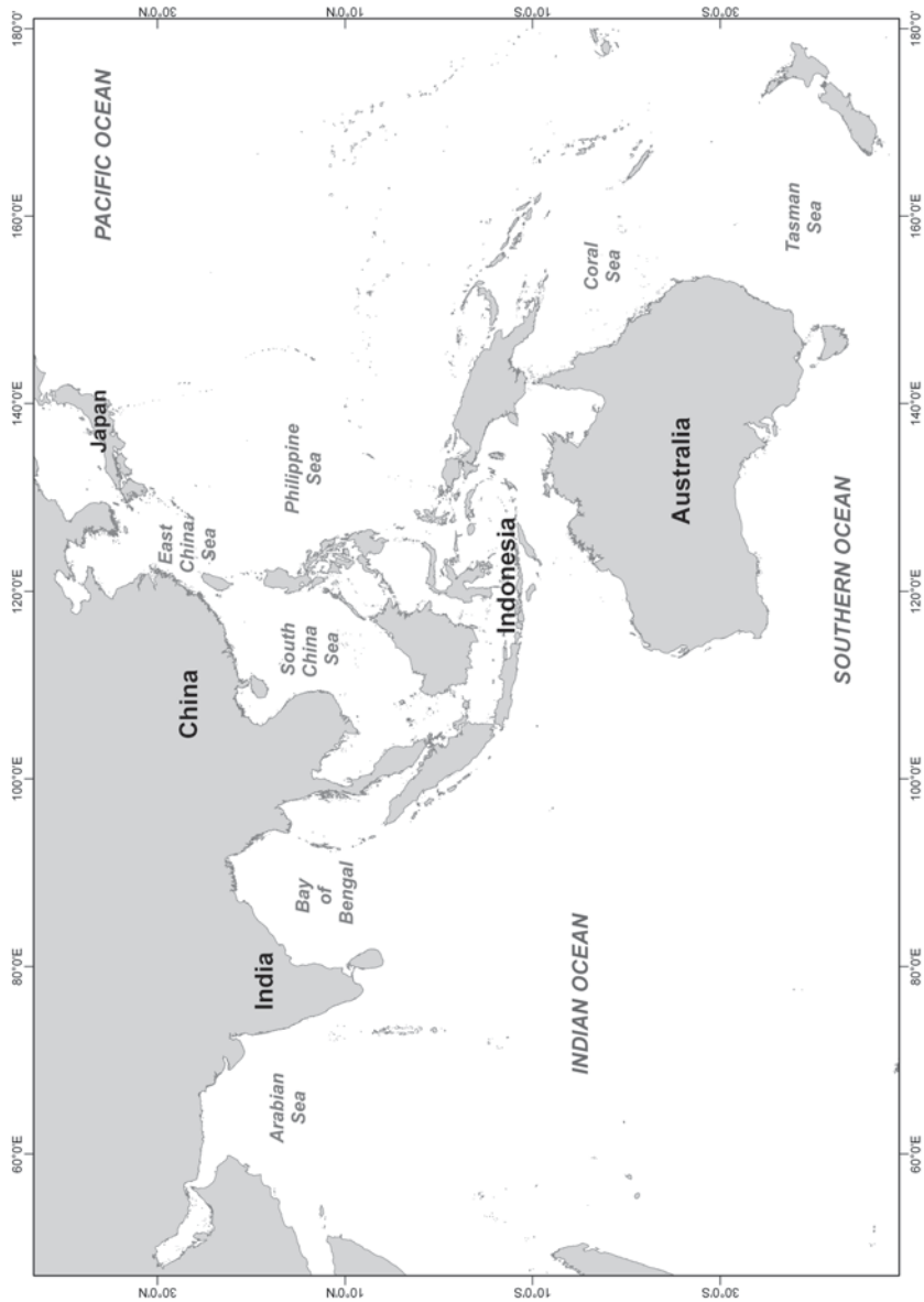
Fig. 2.1 Map of the Central Indo-Pacific

and shelf, as opposed to oceanic, waters. Two large shelf areas, which together form around one-fifth of the shelf area of the entire globe, lie at the centre of the Central Indo-Pacific. The Sunda Shelf encompasses the coastal waters of Burma, the Malacca Straits, the Gulfs of Tonkin and Thailand, the southern part of the South China