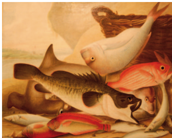
Fig. 2.2 JW Lewin, Fish Catch at Dawes Point (Sydney Harbour, 1813).