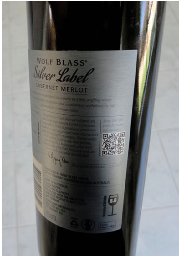
Fig. 2.11 Integration of QR Codes into the wolf bliss label