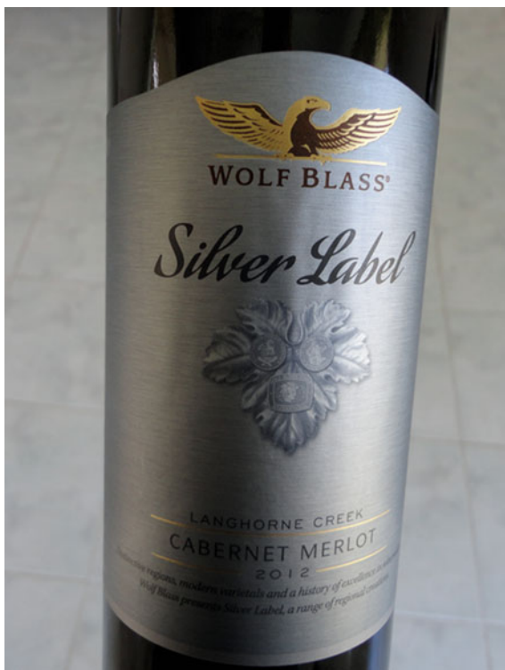
Fig. 2.10 Silver label