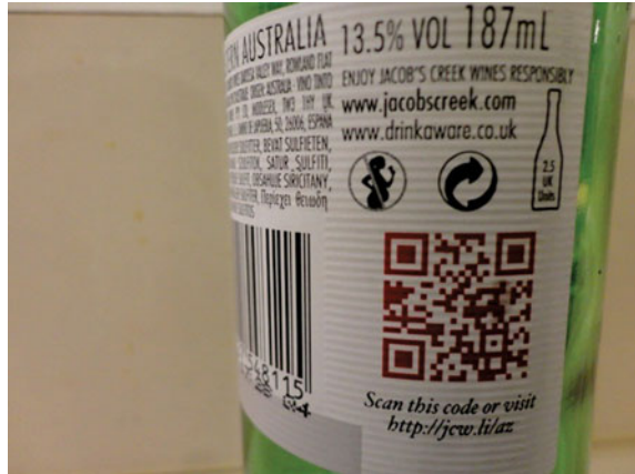
Fig. 2.9 Cheap and cheerful—Jacobs Creek

and cheerful products through to St Hugo, Centenary Hill and Johann. One of the largest global brands in the world, it is an export-driven product and market. Jacob's Creek does matter to this story of QR Codes because they deploy them more heavily than any other winemaker from Australia. The key reason for their use is that this Australian firm has its key markets outside of Australia, particularly the United Kingdom (Fig. 2.9).