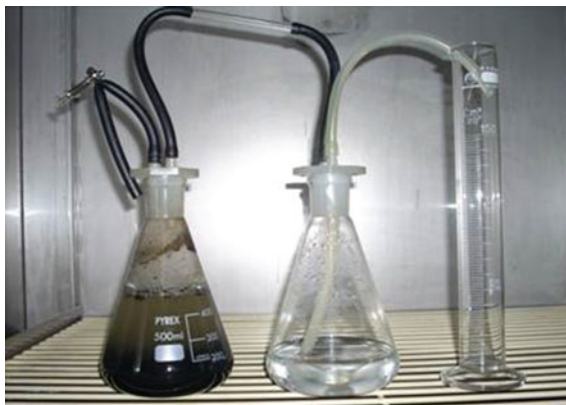
Fig. 2.1 Schematic view of batch test conducted in Erlenmeyer flask Gas production was measured by the water-replacement method

conditions. The treated sludges were used as inocula in a ratio of 10 % v/v in five batch anaerobic tests using 50 g/L glucose as carbon source and macro- and micro-nutrient composition as follows (units mg/L): \text{NaHCO}_3 1,250; \text{NH}_4\text{Cl} 2,500; \text{KH}_2\text{PO}_4 250; \text{K}_2\text{HPO}_4 250; \text{CaCl}_2 500; \text{NiSO}_4 32; \text{MgSO}_4 \cdot 7\text{H}_2\text{O} 320; \text{FeCl}_3 20; \text{Na}_2\text{BO}_4 \cdot \text{H}_2\text{O} 7.2; \text{Na}_2\text{MoO}_4 \cdot 2\text{H}_2\text{O} 14.4; \text{CoCl}_2 \cdot 6\text{H}_2\text{O} 21; \text{MnCl}_2 \cdot 4\text{H}_2\text{O} 30; yeast extract 50. The initial pH of the media was set in the range 7–7.5. The experiments were conducted at 35 \pm 1 °C in a thermostatically-controlled room. A picture of the simple and effective configuration for the tests is shown in Fig. 2.1.