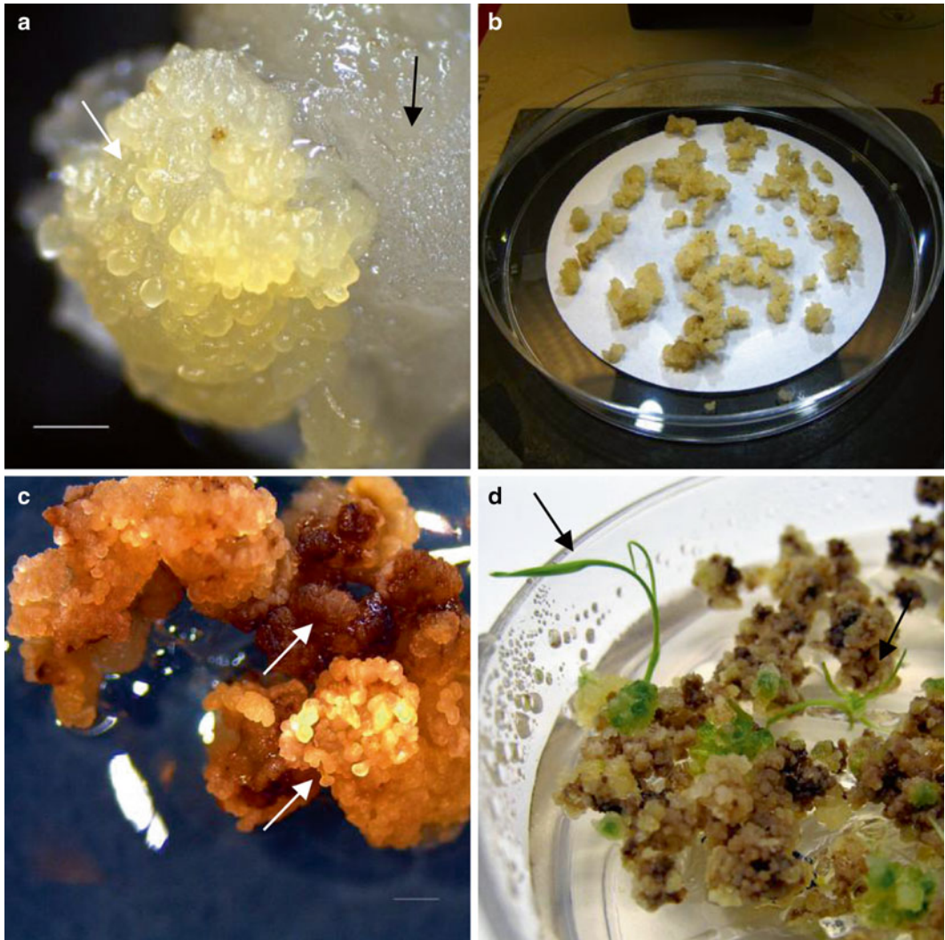
Fig. 2 Embryogenic callus and regenerated transgenic plantlets. (a) Embryogenic callus developing from an embryo 3 weeks after dissecting it from a seed. The white arrow points to a region of structured, yellowish , embryogenic callus. The black arrow points to a region of amorphous, white , watery callus that is not suitable for transformation. (b) Embryogenic callus spread onto filter paper after cocultivation with Agrobacterium . Plate diameter is 100 mm. (c) Embryogenic callus growing on selective media 3 weeks after cocultivation with Agrobacterium . The top arrow points to a region of callus that is not transgenic and is turning brown as the selective agent is killing off the cells. The lower arrow is pointing to a healthy, yellow region of transgenic embryogenic callus. (d) Black arrows point to transgenic plantlets (ranging in size from 0.5 to 1.5 cm tall) regenerating from transgenic callus 2 to 4 weeks after cocultivation. Note the presence of black , dying, non-transgenic callus. Bars = 1 mm (Color figure online)