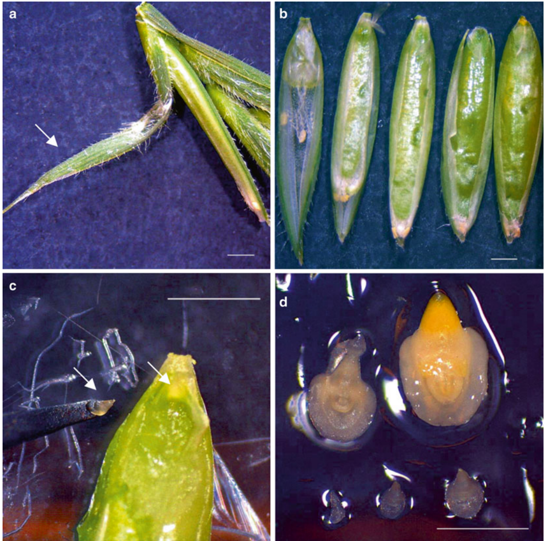
Fig. 1 B. distachyon seed and embryo sources for embryogenic callus. (a) The arrow designates the lemma as it is pulled away from an immature B. distachyon seed. After removing the lemma, the seeds are sterilized and the embryo is dissected out of the seed. (b) B. distachyon seeds are arranged so that the palea side is down , and the region containing the embryo is at the top , and the anthers are at the bottom of the panel. Note the seeds are upside down with respect to how they grow, but this is the most efficient orientation for dissecting out embryos. Seeds are arranged according to increasing maturity from left to right . The endosperm of the two leftmost seeds has not sufficiently filled out, indicating seeds containing embryos that are too small. The embryo in the rightmost seed is too mature to produce embryogenic callus, and yellow color is noticeable at the upper tip of the seed. The size of the embryos within the two remaining seeds is optimal for producing embryogenic callus. (c) The embryo on the tip of fine forceps ( left arrow) that was just dissected out of the immature seed ( right arrow) seen in the center of panel (b) . (d) The top two embryos are opaque and white to yellow in color. These embryos are too mature to form embryogenic callus. The bottom three embryos are colorless and translucent . All three will form embryogenic callus, but the two on the left are optimal. Bars = 1 mm