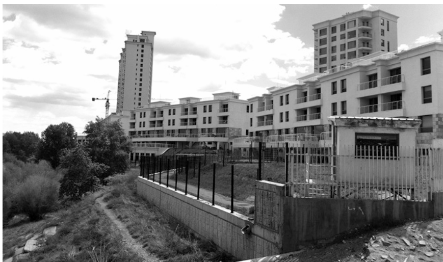
Fig. 2.2 A new gated community in Ulaanbaatar replete with a military style guardhouse

2009). While political privilege with enhanced living conditions existed for those well-connected in the Soviet era from 1921 to 1990, it was not at all comparable to the present day social process of elite emergence through ostentation. Gated communities along with designer clothing, expensive foreign cars, trips abroad, frequent club and restaurant dining, and even speaking English all constitute new forms of asserting social difference. The interesting questions are why would non-indigenous products, practices, and ideas be so prominent in the process of producing social difference and how do these novel imports function socially to establish such differentiation?