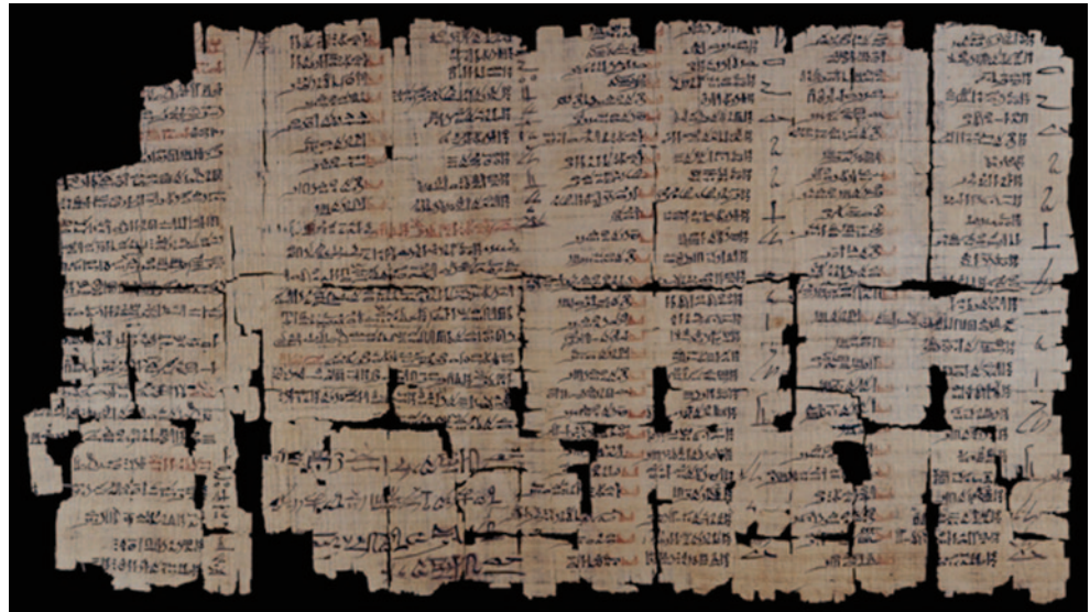
Fig. 2.2 Qenherkhepshef's dream book, BM 10683,3 [10]