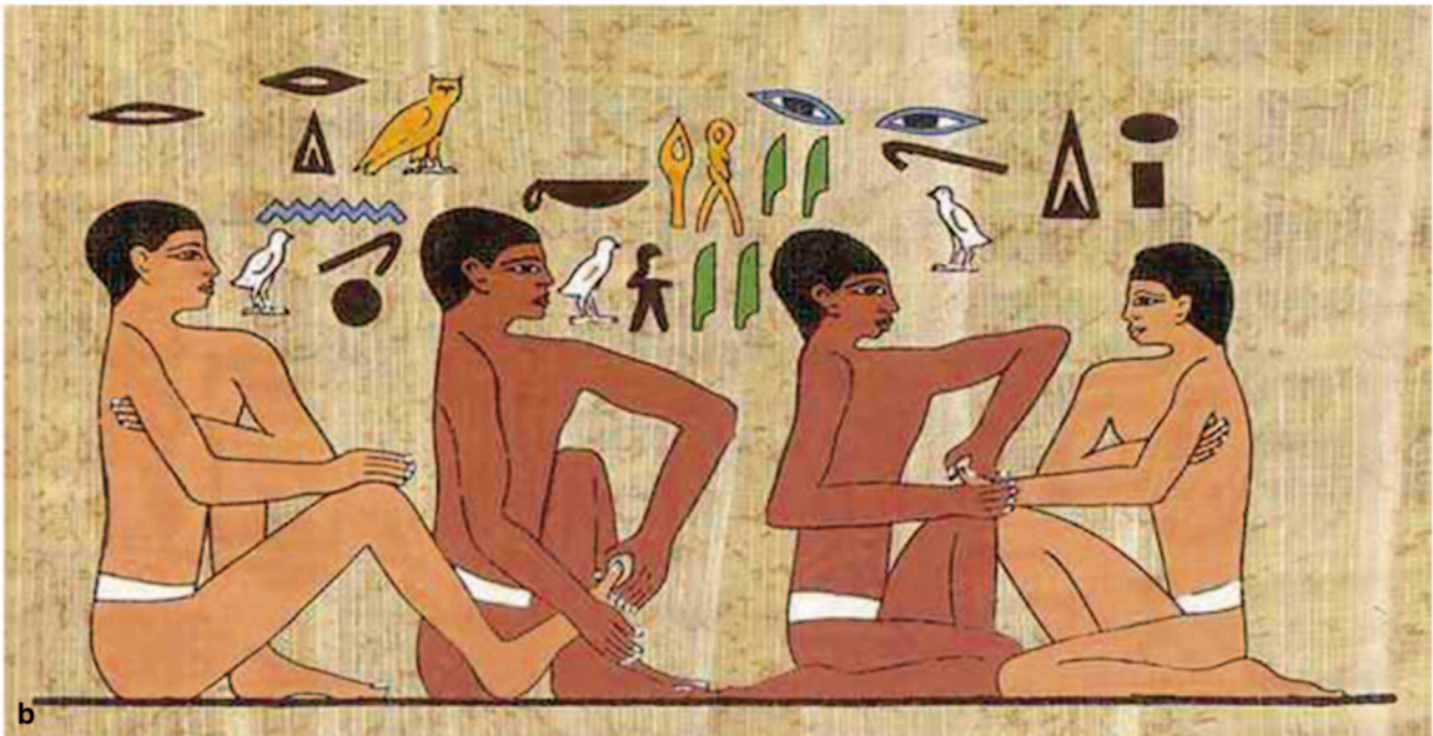
Fig. 2.4 Ebers Papyrus [12]