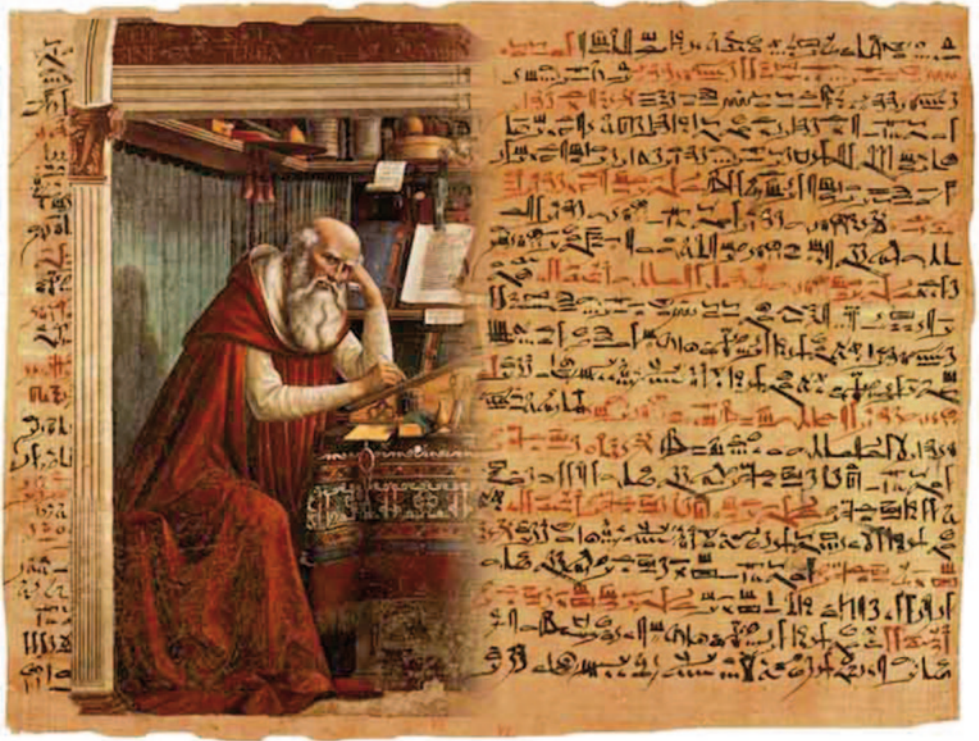
Fig. 2.3 Edwin Smith Papyrus [12]