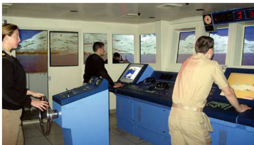
Fig. 2 Route planning, evasive maneuvers, and contingency planning are important elements of antipiracy training that can be included in Bridge Resource Management training for merchant marine officers

Of critical importance in the detection, deterrence, and mitigation of piracy and armed robbery are regular drills and exercises aboard ship. The scope and frequency of security drills and exercises are specified in IMO conventions and national laws. A well-planned and thoroughly practiced response to the contingency of an attempted boarding by pirates or robbers can be highly effective in preventing a successful attack or at least minimizing its negative consequences.