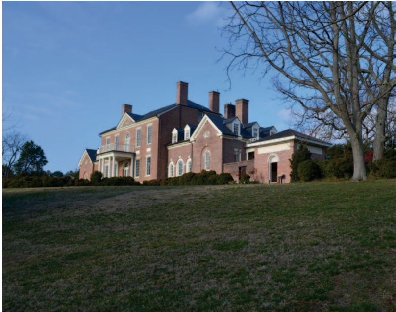
Fig. 2.2 “Woodlawn,” another historic estate, was to be sold to Belgian monks until the Historic Woodlawn Public Foundation stepped in to save it, transferring it to the National Trust as the organization’s first house museum.