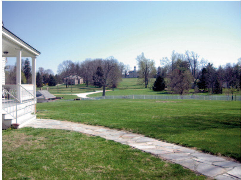
Fig. 2.1 The need to protect “Hampton,” the remarkable eighteenth century mansion north of Baltimore, and other estates like it, was one impetus for the creation of the National Trust for Historic Preservation.