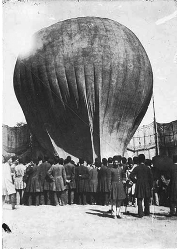
2.5 In 1877 Tehran residents gather to watch the landing of a balloon for the first time in Iran. [Wikipedia]

Bell Helicopter, a division of Textron, Inc., built a factory in Isfahan to produce Model-214 helicopters and Northrop partnered with Iran Aircraft Industries, Inc., to maintain many of the US military aircraft that Iran purchased. The Iranian company was expected to go on to produce aircraft components and eventually complete planes. 18