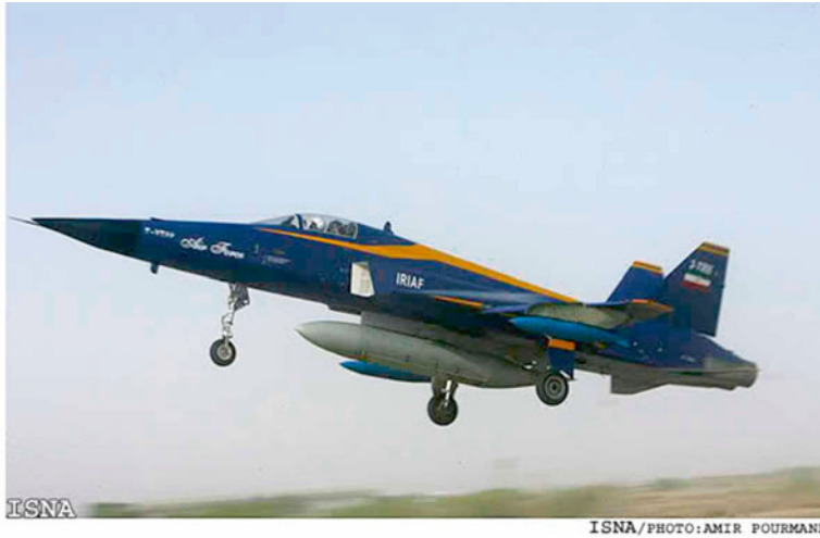
2.21 The indigenously designed and manufactured Azarakhsh fighter jet.

producing the indigenously designed Azarakhsh and Saegheh fighter jets and had plans to expand its production to helicopters, turboprops and passenger planes. 42 The country's Boeing 737-800 simulator is the first in the Middle East. Iran currently possesses only nine aircraft for every million citizens but the objective is to make 6,300 airplanes available to the Iranian population of 70 million. 43 The Research Institute of IAIO is involved in the design of piloted and pilotless aircraft, the simulation of aerodynamic processes in computational fluid dynamics laboratories, the provision of aerodynamics tests, the development of aviation products using the national wind tunnel, the design of systems for launching and retrieving aircraft, the standardization and validation of avionic products for training purposes, the promotion and development of laboratories appropriate to the aviation industry, and the evaluation, control and auditing of aviation projects. 44