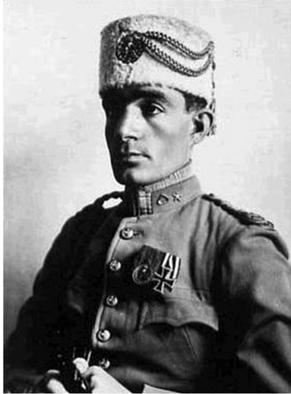
2.6 Colonel Muhammad Taghi Pesyan (1892-1921), born in Tabriz, was a popular military leader of Iran and the first Iranian to successfully pilot an aircraft. He was the commander of Gendarmerie in 1915, and wrote two books in the Persian language Sargozasht-e yek javan-e vatan-doust (The Story of a Young Patriot) and Jang-e Moghaddas az Baghdad ta Iran (The Sacred War from Baghdad to Iran). [Wikipedia]

organizations alongside the non-civilian services and logistics. The rapid pace of development resulted in a partnership between the private sector and Iran Airways in 1944 by Iranian private investment. The next in this group was the Persian Air Service (PAS), which began operating in 1952. Iran Airways and the Persian Air Service merged as Iran Airline in 1961. In 1962 state nationalization of the air transportation industry established the Iranian National Airline (called Homa in the Persian language) to operate under the regulations imposed by the International Air Transport Association (IATA). Over the ensuing years, the number of active air agencies grew to 13 with 120 airliners. Homa and Iran Air Tour were both state air agencies and Aseman was operating as a semi-state agency.