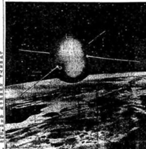
SATELLITE IN SKY—With Russian announcement that it has launched first earth satellite, this is artist's conception, superimposed on actual photograph of Southern United States from 140 miles up, of what the U.S. satellite would look like in flight. Drawing of 20-inch diameter globe was prepared of Naval Research Laboratory in Washington, D.C. Russian satellite is said to be 23 inches in diameter, weigh 185 pounds and orbit 500 miles above the earth.

Pittsburgh scored first in the first period and never trailed. The Panthers put on a brilliant ground attack, producing a 20-14 victory over the 42-0 team in Memorial Stadium.