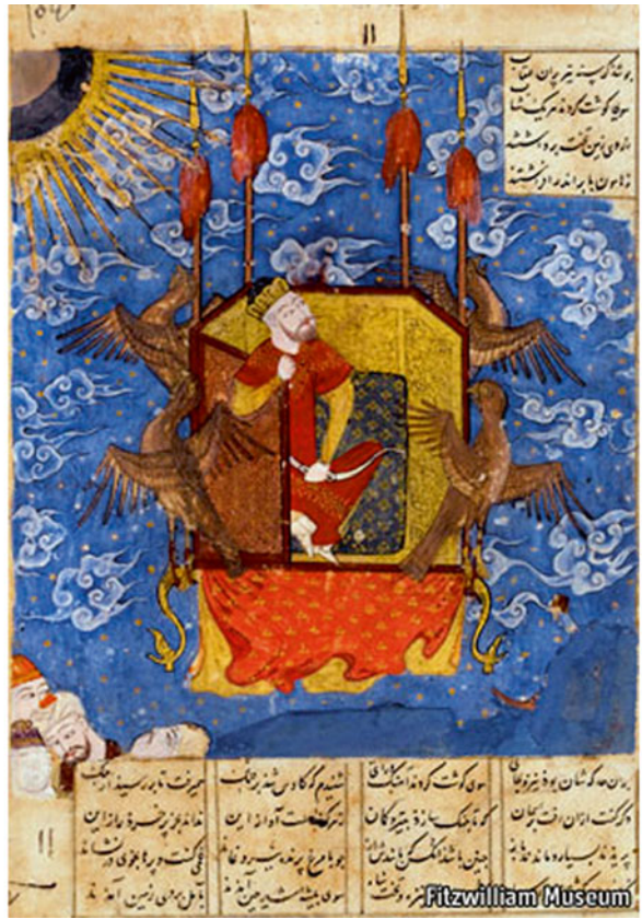
2.1 A page from Shah-Nameh (Book of Kings), in which Ferdowsi describes how Kay Kāvus ascends to Heaven with the aid of hungry eagles.

There are frequent references in Iranian mythology to flying, the most popular being the flights of two Iranian mythical kings Kay Kāvus and Jamshid, and the Iranian hero Rustam. 7 For example, Kay Kāvus ascended into the sky with the aid of hungry eagles. This was described by the highly revered Persian poet Hakim Abul Ghasim Ferdowsi-e Tusi (940-1020) 8 in his magnificent masterpiece Shah-Nameh (Book of Kings) which is the national epic of Iran and the Persian-speaking world. 9