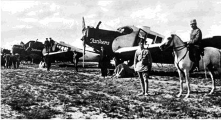
2.8 Iran's Junkers-F13 aircraft.