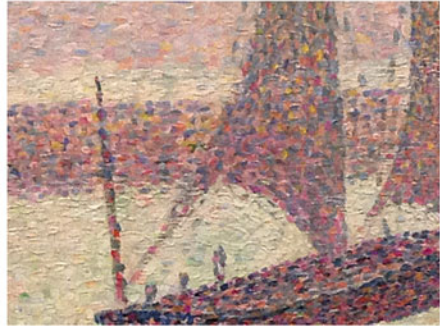
Figs. 2.1 and 2.2 George-Pierre Seurat, The Channel at Gravelines , 1890