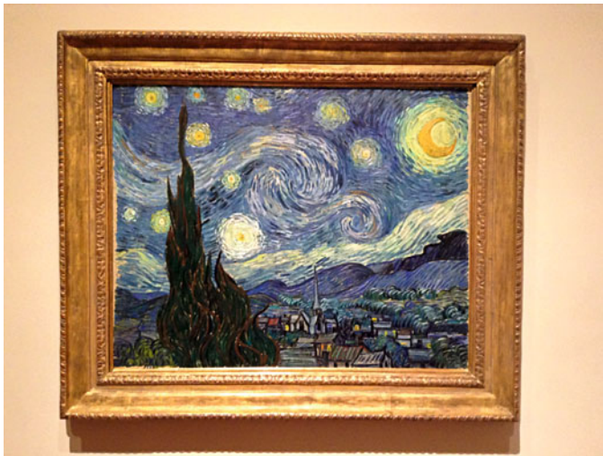
Fig. 2.3 Vincent van Gogh, The Starry Night , 1889

of the sciences. In fact, when one studies the parallelisms between artistic and scientific history, the fundamental upheavals in music, the visual arts and design, and the paradigmatic shifts in physics, psychology and medicine in the early twentieth century make particularly plain the interactions between what are apparently separate spheres.