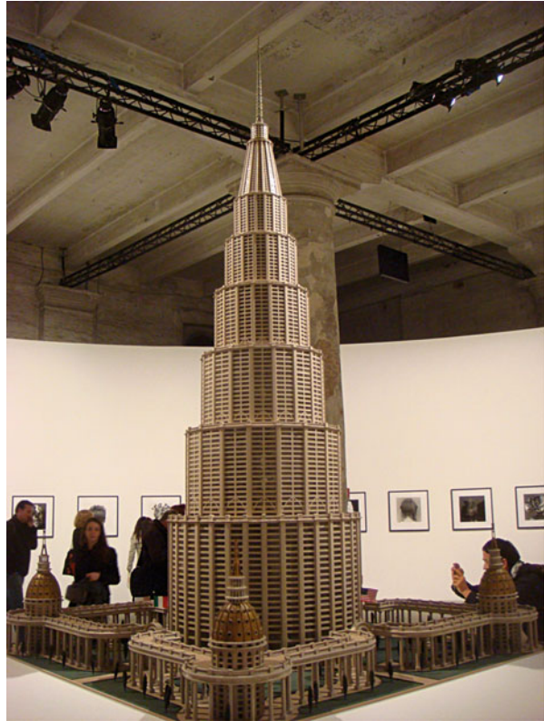
Fig. 2.4 Marino Auriti, The Encyclopaedic Palace of the World, ca 1950s

be too small even for a single scientific discipline. Auriti's model, shown at the Biennale di Venezia in 2013, reminds of Breughel's Tower of Babylon (Fig. 2.5).