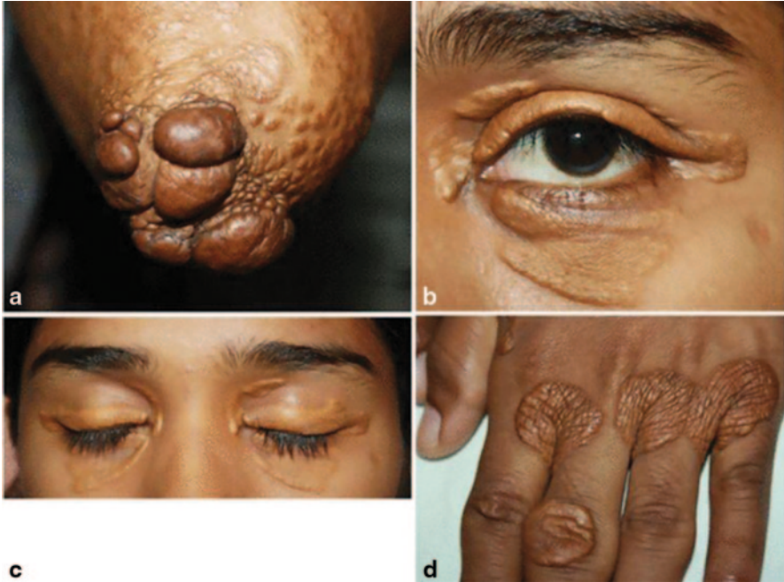
Fig. 2.2 a. Tuberos xanthoma of elbow b. Cutaneous xanthoma around the eye. c. Xanthelasma palpebrarum, arcus juvenalis. d. Intertrigenous xanthoma.

most common cardiovascular disease in FH is coronary heart disease (CHD), which may manifest as angina and myocardial infarction; stroke occurs more rarely.