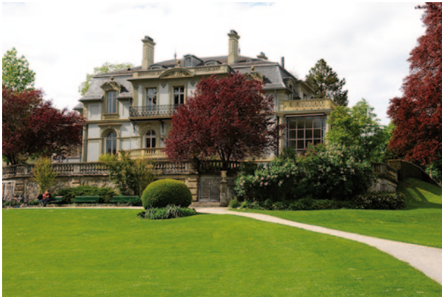
Fig. 1 Kocher Park with House of University, Bern.