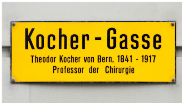
Fig. 2 Street sign of the Kochergasse.

ing is still contemporary and has applications for the purpose of ensuring the highest quality surgical care. Fausto Chiesa summarized his strategy in an editorial around four points: (1) the importance of meticulous and repeated observations; (2) the knowledge of anatomy, pathology, and surgical techniques; (3) the accuracy, care, and patience that are necessary during surgical procedures (It is more important to be safe than fast!); and (4) the critical audit of results [12].