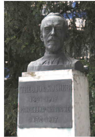
Fig. 3 Bust of Kocher in front of the Inselspital, Bern.

His fame and reputation as the first premier high-volume thyroid surgeon is robust today; rarely does a day go by when surgical trainees do not learn about the importance of the Kocher maneuver during pancreaticoduodenectomy, or perform a Kocher incision during thyroidectomy, or utilize or pass a Kocher clamp. His name and spirit continue to live