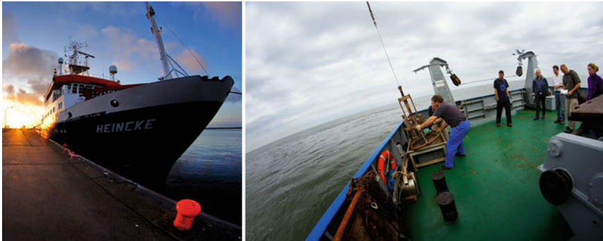
Fig. 1 One of the ESSReS excursions included a trip on-board RV Heincke ( left ) to get hand-on experience in sea floor mapping in the German Bight near Helgoland, another excursion was carried out with the RC Uthörn ( right ) to the Weser Mouth [The RV Heincke cruise 2012 has been effective and interesting for both, the ESSReS PhD students and the shipboard system operator. An ESSReS computer scientist, who had never been on-board of a research vessel before, worked within the bathymetry group to learn the mapping of the North Sea seafloor nearby Helgoland. The ESSReS PhD student learned a lot about the multi-beam echo-sounder system, but recognized that the data processing on-board was inefficient. He wrote a few scripts to automate the manual work and to enhance the shipboard workflow, which is now helpful for all shipboard scientists in the future]

scientific questions in Earth System Science. Introductory lectures were given by senior scientists from the participating institutes, covering topics such as remote sensing of the atmosphere, the climate system and its components, and an overview of the complex system within the living ocean. Two cruises with research vessels (RC Uthörn, RV Heincke) were offered with practical courses, providing an introduction to ship-borne marine bio-geoscience research methods and to gain first-hand experience in applied oceanography, biology, geology and geophysics (Fig. 1). Next to these scientific topics, marine navigation and positioning systems were introduced to the PhD students. After participating in these short trips to Helgoland (RV Heincke) or to the Weser Mouth (RC Uthörn) some PhD students were highly motivated to join longer research trips to the northern and southern polar region (e.g. on board RV Polarstern).