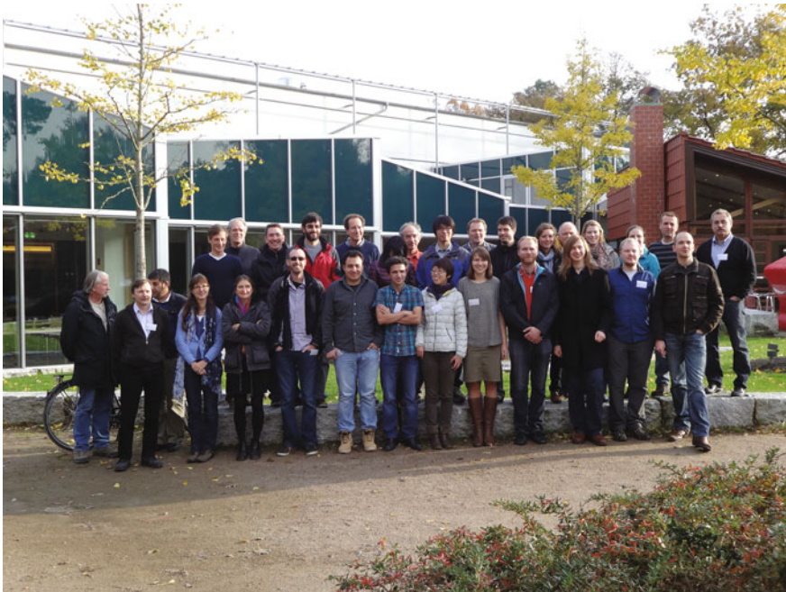
Fig. 2 ESSReS students and supervisors at the second ESSReS retreat at the Botanika Conference Centre in Bremen (November 2013)

An annual retreat in autumn of each year was held to ensure a regular exchange between the PhD students and the supervisors/senior scientists of the three institutions (Fig. 2). The supervisors and other scientists from the working fields of each PhD student were invited to participate in the retreat, where oral and poster