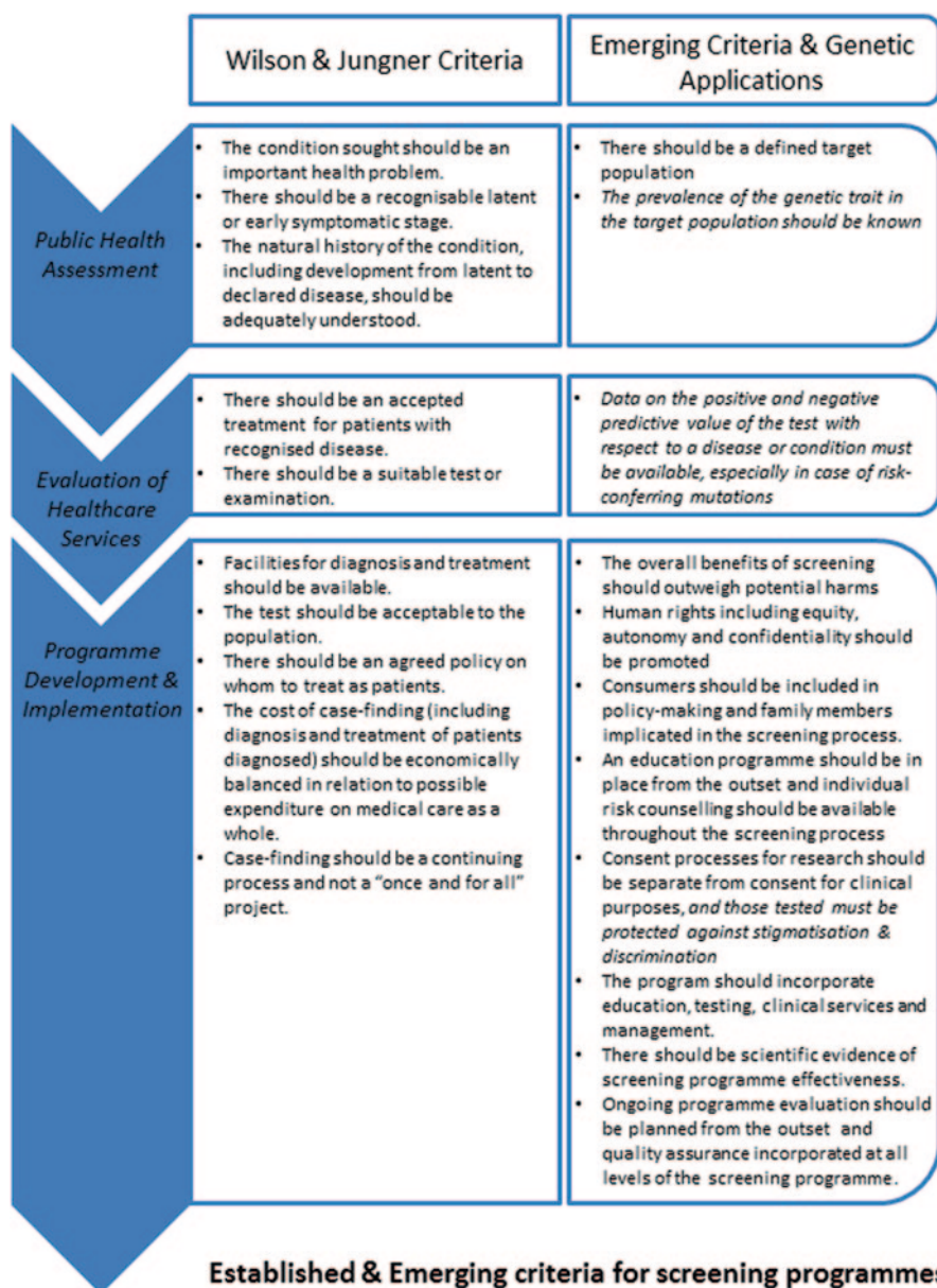
Fig. 2 Established [3] & emerging [5, 115] criteria for screening programmes, with criteria which specifically apply to genetic screening programmes in italics