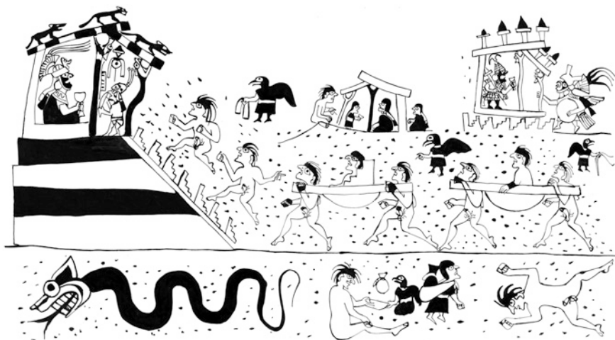
Fig. 2.8 Fineline drawing of a Moche vessel depicting a ceremonial architectural setting. Drawing by Donna McClelland.

of postmortem dismemberment (Chapdelaine et al. 2009; Verano 2001, 2008). Dismembered human remains also appear in tombs of high officials, with sacrificed individuals (or curated bodies) being found as companions of main buried individuals (Alva and Donnan 1993: 164; Strong and Evans 1952: 150–156). These practices are represented in Moche iconography, which shows that human sacrifice was performed by warriors, religious officials, and priestesses as the ultimate offering to gods and ancestors. The manipulation of the human body allowed its transformation into a material symbolizing the symbolic and political power of rituals that established metaphorical linkages between the prisoners, the feminine, and the fertilizing power of blood (De Bock 2005; Scher 2012). In local context, the political hegemony and strategies of dominion implemented from Huacas de Moche could have been conducted through warfare against other polities. Confrontations and dominion were however clearly immersed in the politics of social interaction, ceremonial drama, and ritual management of social reproduction and fertility (Fig. 2.8).