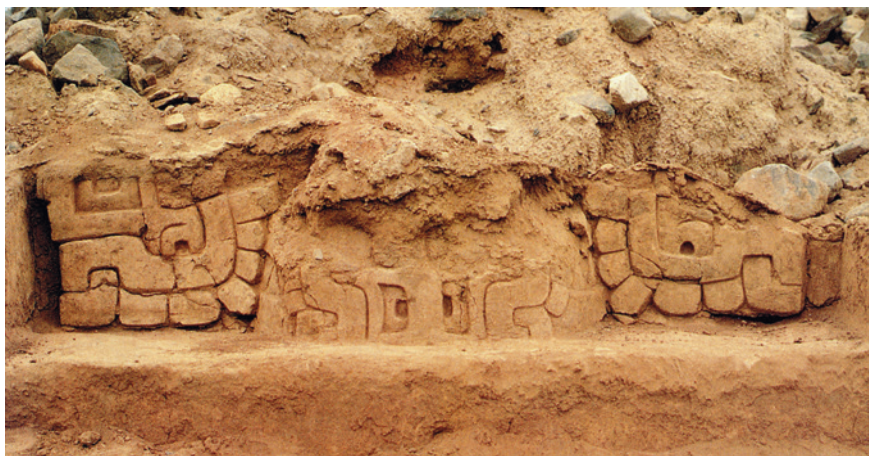
Fig. 2.3 Cupisnique god effigy from Huaca de los Reyes, Caballo Muerto

After a century of research on local Pre-Columbian societies, it has been established that the emergence of the earliest agricultural communities in the Moche Valley dates back to the third millennium BC, with available data pointing to the fishermen and farmers of the lower valley as the creators of the first local ceremonial centers around 2000 BC (Briceño and Billman 2008; Pozorski and Pozorski 1979; Prieto 2011). Between 1500 and 500 BC, the region experienced the consolidation of the Cupisnique culture. The Cupisnique established a series of ceremonial centers that show the evolution of the principles of authority and social hierarchy during the Andean Formative period. The primary settlements of that period in the Moche Valley include the Caballo Muerto, Sacachique, Puente Serrano, Huaca de los Chinos, and Huaca Rajay sites (Gálvez and Runcio 2007; Nesbitt 2012; Nesbitt et al. 2010; Pineda 2004; Pozorski 1982, 1983 inter alia ), each featuring massive buildings decorated with polychrome reliefs of jaguar-like beings (Fig. 2.3). Ceremonial Cupisnique ceramics in the Moche Valley included