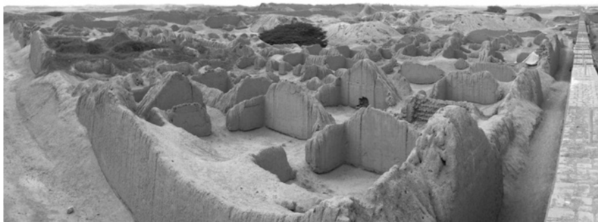
Fig. 2.9 Chan Chan. Xllangchic-An Compound, formerly known as Uhle Citadel

settlement included walled compounds that housed the Chimú nobility and extensive lower-class residential areas occupied by weavers, metallurgists, and ceramists (Day 1982; Kolata 1990; Topic 1982, 1990). Chan Chan progressively grew in size from 900 AD, with dynastic successions and a pattern of split inheritance resulting in the construction of ten royal precincts, the largest one covering an area of 210,900 m 2 (Moore 1996: 68–86). Each walled compound was composed of inner plazas, elite tombs, and extensive storage areas (Fig. 2.9). The walls of the principal buildings were covered with clay friezes illustrating maritime scenes and geometric compositions inspired by textile designs (Pillsbury 2009). Many of the walled compounds and temples of Chan Chan were apparently oriented toward prominent mountain peaks considered as sacred places (Sakai 1998). The ideology and economy of Chan Chan's residents was characterized by the intensive exploitation of marine resources and the management of agricultural production supported by extensive systems of artificial irrigation. Craft production and long-distance trade of goods such as Spondylus shells also played a major role in the socioeconomic organization of the Chimú capital.