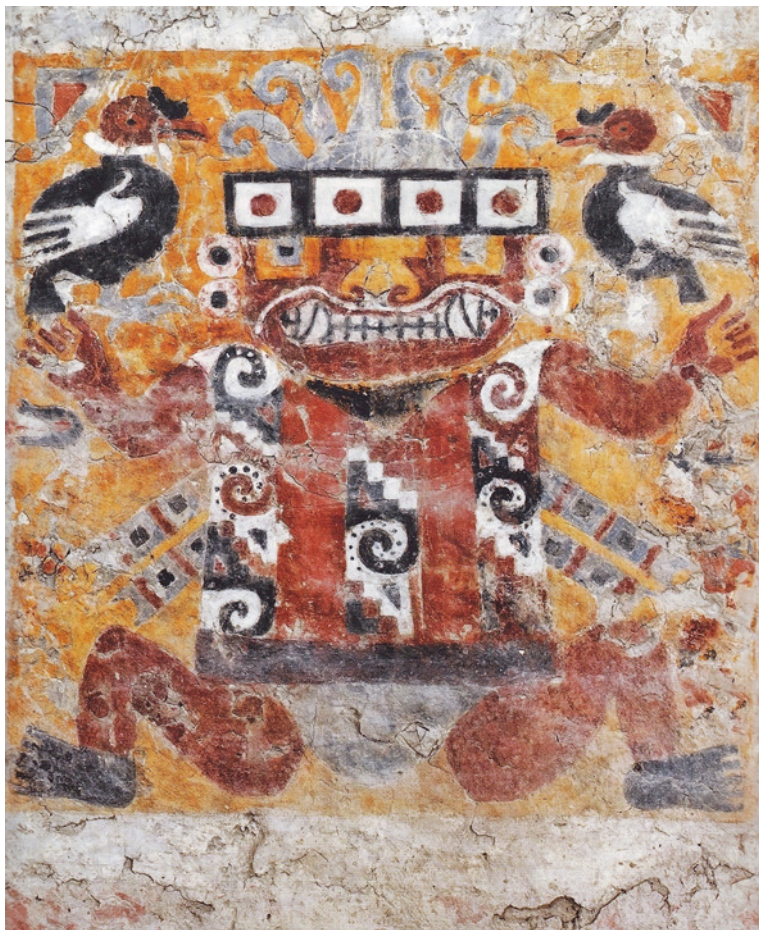
Fig. 2.4 Moche mural depicting a god recorded at Cao Viejo

The most famous ancient Moche site is Huacas de Moche, a primary settlement located just outside Trujillo in the south margin of the Lower Moche Valley (Fig. 2.7). Huacas de Moche was a large urban center composed of residential complexes, walled plazas, and craft production workshops, all dominated by the two monumental architectural compounds of Huaca del Sol and Huaca de la Luna—immense, solid adobe pyramid mounds with room complexes in their summits. In the fourth century AD, the rulers of Huacas de Moche became inserted into the regional political scene, beginning a long-term partnership with the site of El Brujo in the Chicama Valley and establishing strong links with the lords of El Castillo de Santa in the Santa Valley (Chapdelaine 2010, 2011; Franco 2009; Mujica 2007). This was also the time of the flourishing of the royal courts of Loma Negra, Sipán, Ucupe, and Dos Cabezas in the northern Moche valleys (Alva and Donnan 1993; Bourget 2010; Donnan 2008; Jones 2001).