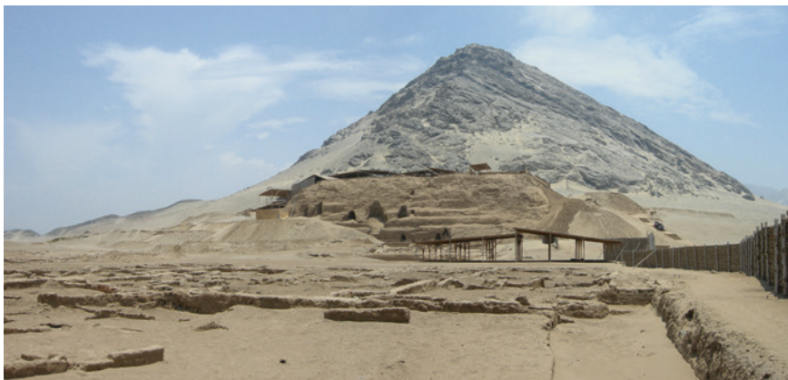
Fig. 2.7 Huacas de Moche

Huacas de Moche is one of the most intensively studied urban landscapes of the Moche society. The eastern sector of the settlement (dominated by the towering Cerro Blanco mountain) was occupied by the Huaca de la Luna complex, a precinct dedicated to religious propitiation and the funerary rites of priests and nobles. Its main component was Platform I, a building profusely decorated with polychrome reliefs and mural paintings of deities, supernatural beings, and human warriors. Through its 500-year construction sequence, this building was associated with a main walled plaza and several courtyards, open spaces where the community brought together during public events such as celebrations of warfare, ritual dances, and meetings of high-ranking individuals (Bourget 2001; Gamboa 2008, 2014; Uceda 2001).