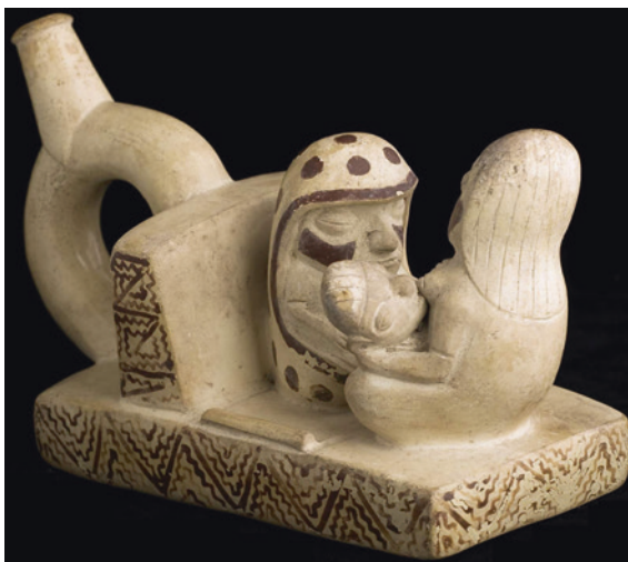
Fig. 2.6 Moche vessel depicting curandera and woman with a baby, excavated at Cao Viejo