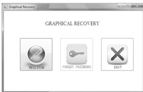
Fig. 1 The screenshot of the prototype's main menu