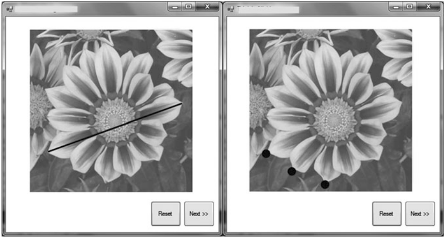
Fig. 3 Screenshots of examples from draw-based secret (left) and click-based secret (right)