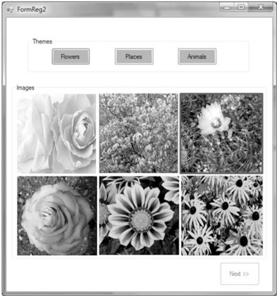
Fig. 2 Screenshot from choice-based secret