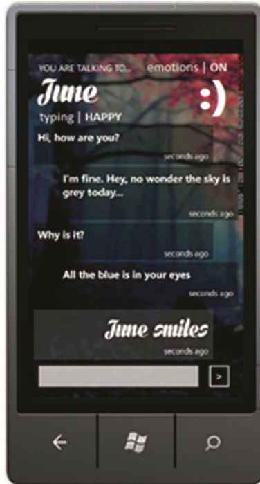
Fig. 3. Screenshot of the application

Our solution differed from the related research for it did not attempt to extract affection from the semantics of the text and did not use any extra hardware to collect images or physiological signals. Finally, our work is devoted to relaying emotions on mobile text chat scenarios, relying on lower end devices with front cameras.