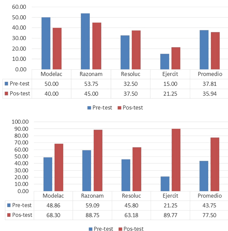
Fig. 3. Comparison. Means obtained for the control (upper) and experimental (lower) groups by mathematical process. Modelac stands for modeling , Razonam for reasoning , Resoluc for problem solving , Ejercit for exercising and Promedio for average .

If the results of each mathematical process after the intervention are compared, we can see that there is a significant difference in all the processes in favour to the experimental group. Especially noteworthy are the results of the exercising process, with a difference of over 68 points.