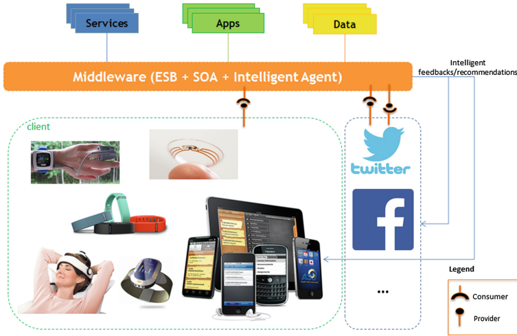
Fig. 1. The high-level view of the Device Nimbus concept

proposed middleware aims to collect and process data from multiple sources, as well as to infer events or patterns that suggest more complicated circumstances.