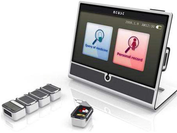
Fig. 1. A drug management system proposed at a MedGadget show [18].

knowing they are independent and that they can do whatever they like in their own home.