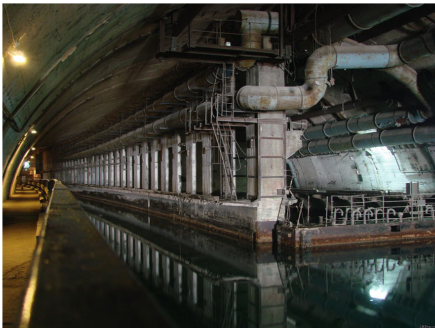
Balaklava naval museum: The underground harbor for submarines. http://ukrtrip.com/uploads/posts/1184696502_dsc05256.jpg

“Balaklava” – naval museum complex sited in Balaklava Harbor which was a secret underground submarine base during the Soviet period. The Great Patriotic War (WWII) over, on I.V. Stalin's order the world's only underground harbor with submarine repair works was built here, top-secret facility No. 825. The construction began in the western cliff of Mt. Tavros in 1957. The first stage of the plant (submarine repair base) was commissioned in 1961. The second stage (fuel depots for the storage of petrol, oil and lubricants of 9.5 thousand tons capacity, and the arsenal) was completed in 1963. The plant was assigned the first category of stability in respect of nuclear threat. A combined canal for the entry of submarines and the entire infrastructure of the underground works made it possible to repair and service submarines independently. At the end of 1994, the Russian Black Sea Navy Command makes a decision to discard the submarine base. The last Russian submarine was removed from the harbor in February of 1995, whereupon the underground submarine harbor was fully transferred under the jurisdiction of Ukraine. By order of the Ukraine President (2002), B. became an integral part of the State Naval Museum opened in Sevastopol.