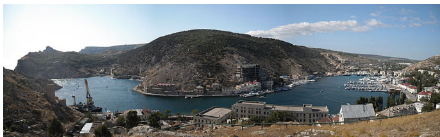
Balaklava: Panoramic view of the town ( http://ru.wikipedia.org/wiki/Балаклава )

At present, the harbor gradually is being turned into a yacht club. B. places of interest include the Genoese Fortress Cembalo, Twelve Apostles Cathedral (built in 1357), Naval Museum Complex “Balaklava”. The winery “Golden Balka” is in B.