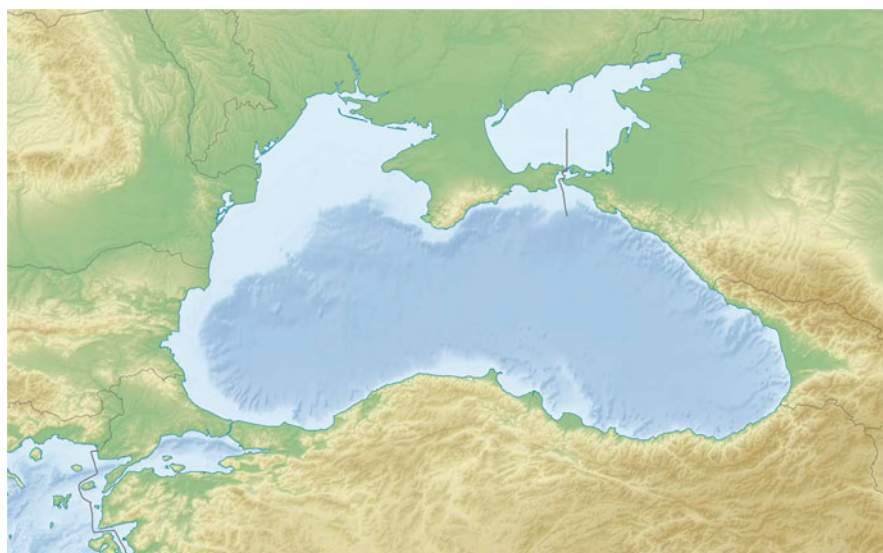
The Black Sea bottom and land topography ( http://upload.wikimedia.org/wikipedia/commons/thumb/8/89/Black_Sea_relief_location_map.svg/2000px-Black_Sea_relief_location_map.svg.png?uselang=ru )

Three major structures are distinguished in the seabed relief: the shelf, continental slope and deep-water basin. The shelf accounts for up to 25 % of the seabed total area and, on the average, is confined by the depths of 100–120 m. The shelf's maximum width (over 200 km) is in the northwestern part of the sea, all of which is within the shelf zone. Nearly throughout the mountainous eastern and southern coasts of the sea, the shelf is rather narrow, just a few kilometers, while in the southwestern part of the sea it is wider (dozens of kilometers). The continental slope occupying up to 40 % of the seabed area goes down roughly to the depths of 2,000 m. The slope is quite steep and is dissected by underwater valleys and canyons. The bottom of the basin (35 %) is a flat aggraded plain, whose depths gradually increase centerward.