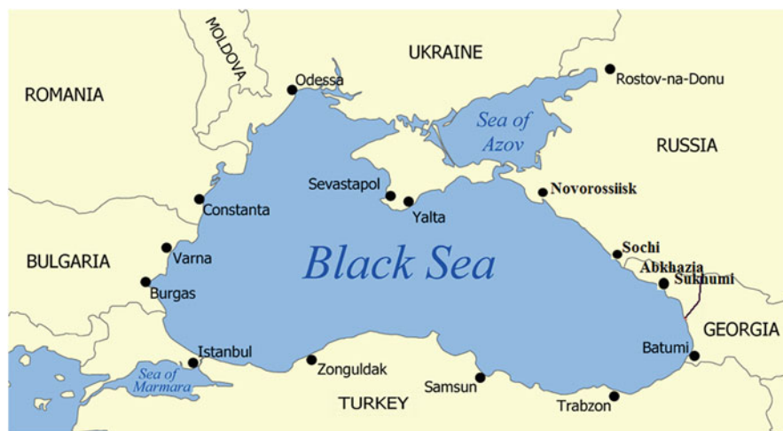
The Black Sea countries

Black Sea – The Black Sea (together with the Sea of Azov) projecting far into the continent constitutes a most insular part of the World Ocean and is part of the basin of the Atlantic Ocean. B.S. washes the coasts of Russia, Ukraine, Romania, Bulgaria, Turkey, Georgia and Abkhazia. The sea is linked by Bosphorus Strait with the Sea of Marmara, and by Kerch Strait—with the Sea of Azov. The Black Sea area is 423,000 km 2 , the volume of water is 555,000 km 3 , mean depth—1,315 m, maximum depth—2,258 m, the length of the coastline is 4,340 km.