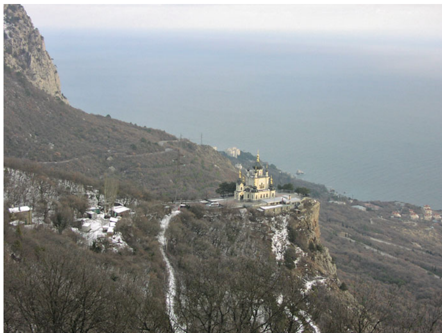
Baidarskie vorota: View on the Russian Church and coast of the Black Sea

Baidarskie vorota (gates) – pass over the main ridge of the Crimean Mountains from Baidarskaya valley to the Black Sea coast. Height 739 m. Built in 1848 and are famous for their extremely dramatic position. The gates are on the very edge of a precipitous rock, almost a seaward escarp. Immediately beyond the gates, there is an imposing view of the Southern Coast of the Crimea (SCC) and the Black Sea.