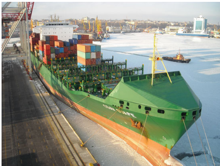
Ice cover in Odessa port on 1 February 2012