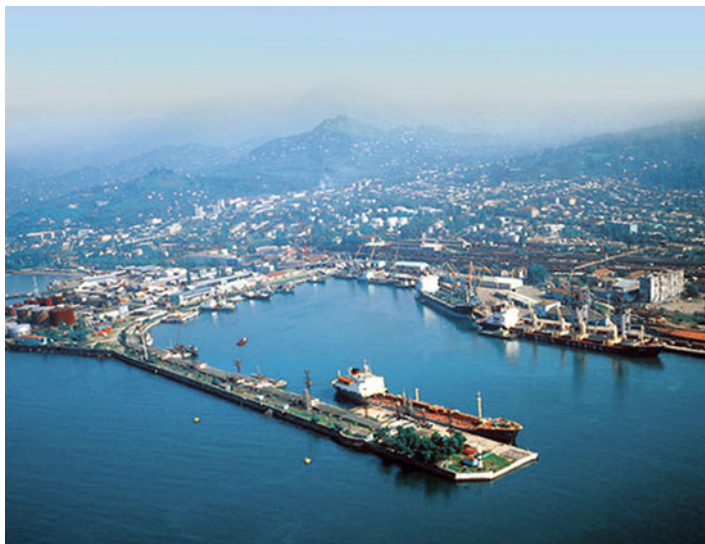
Batumi: View on the port

In B. there is a Sea Aquarium and Dolphinarium as well as a number of museums (Museum of Adjara, Revolution Museum, I.V. Stalin's House-museum).