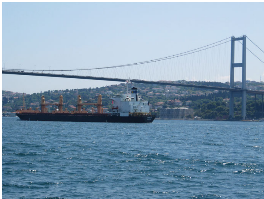
Bosphorus bridge

Bosphorus bridge – also called the First Bosphorus Bridge is one of the two bridges in Istanbul, Turkey , spanning the Bosphorus Strait and connecting Europe and Asia (the other one is the Fatih Sultan Mehmet Bridge , which is called the Second Bosphorus Bridge). It was opened on 30 October 1973. Its length is 1,510 m. At present, it is the 19th longest suspension bridge span in the world. The width of the cable-stayed bridge is 39 m. The bridge height over the Bosphorus is 64 m. The bridge was designed by the renowned British civil engineers Sir Gilbert Roberts and William Brown . A.B. is one of the symbols of Turkey.