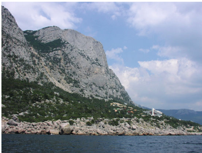
Batilman: View from the sea