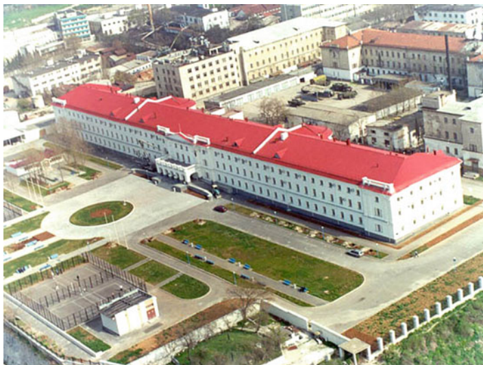
Black Sea Branch of Lomonosov Moscow State University ( http://www.hist.msu.ru/Photo/sev1.jpg )

“Black Sea—Caspian Sea” Canal – project that since the end of the nineteenth century has been toyed with on and off as one of the options to stabilize the level of the Caspian Sea. In a most general form, the project is a canal taking off the Black Sea water in an area north of Novorossiisk, run along the eastern coast of the Sea of Azov, on along Manych Depression toward Kizlar Bay of the Caspian Sea. The existing difference between the levels of the Black and Caspian Seas—around 28 m and congenial topography dividing their territories makes it possible to supply Black Sea water to the Caspian Sea by gravity flow. However, implementation of the project may have unwanted consequences to the Caspian Sea fauna.