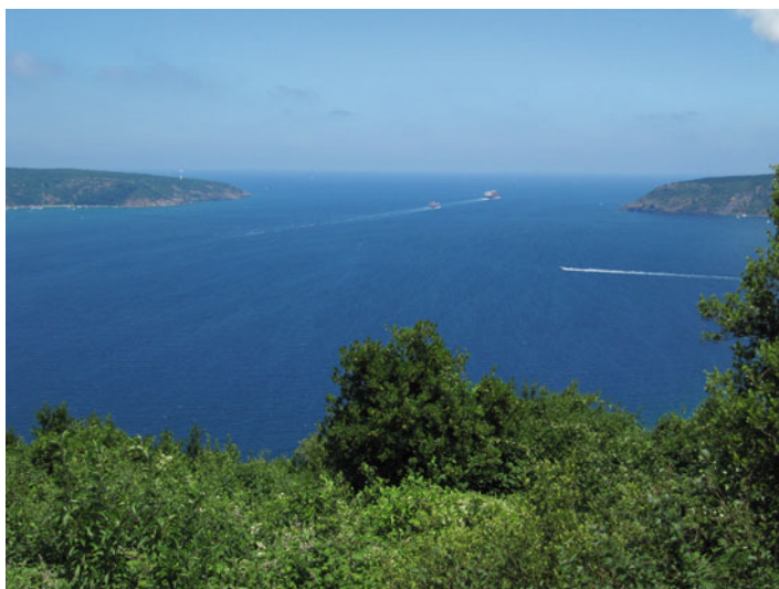
Bosporus Strait: View on the Black Sea

170 km 3 of Mediterranean Sea water per year (salinity 37–38‰) to the Black Sea. Water temperature in winter 10–11 °C, in summer 19–20 °C. The current is produced by the different water densities in the seas. Water exchange via the strait may change significantly due to different forcing and hydrometeorological conditions. Both the currents were for the first time studied by the Russian scholar Admiral S.O. Makarov. B. is extremely important in terms of economy, policy and military strategy not only to Turkey, but to all the Black Sea states.