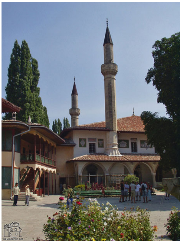
Bakhchisaray

Bakhchisaray Peace of 1681 – Treaty of Bakhchisaray between Russia, Turkey and Crimean Khanate establishing a 20-year truce. Concluded on 13 January 1681 at Bakhchisaray. Terminated the Russian-Turkish war of 1676–1681. For the B.P. to be approved by the Sultan, a Russian Mission was sent to Istanbul in 1631 with a commission to gain the frontier along the rivers Tyasmin, Ros and Ingul, obtain Sultan's recognition of Zaporozhye as a Russian possession and push through prohibition for both the parties to settle the area between the rivers Dnieper and Bug. In the ratification instrument handed over to the Russian side in March of 1682 the Turkish terms were listed: 20-year truce; frontier to run along the Dnieper, except Kiev and Cities of Vasilkov, Tripolye, Staiki and others that remained in possession of Russia; the Russian government was not allowed to build cities (fortresses) on either side of the Dnieper; the Russian nationals were free to procure firewood and salt on the Turkish side of the Dnieper; the dwellers on either side of the Dnieper were free to settle where they wished; the prisoners of war were exchanged; Russian pilgrims were allowed to travel to Jerusalem. Russia accepted the Turkish terms. The crucial achievement of Russian diplomacy was recognition by Turkey of Kiev and its environs that belonged to Russia.