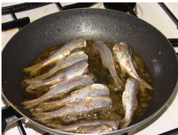
Barabulka (red mullet) fried in a pan

Barabulka – surmullet ( Mullus barbatus ) is a species of goatfish found in the Mediterranean Sea , North-East Atlantic Ocean from Scandinavia to Senegal , and the Black Sea . Length—10 to 20 cm. This is favored delicacies in the Mediterranean and the Black Sea countries, and in antiquity were “one of the most famous and valued fish”.