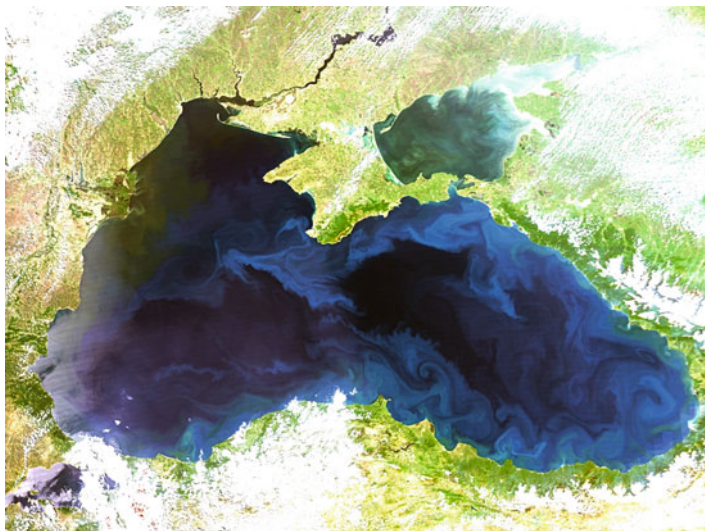
Satellite image of mesoscale vortical structures along the coast of the Black Sea

The temperature of water on the surface of the sea in winter rises from -0.5 \dots 0 °C in the coastal areas in the north-west to 7-8 °C in the central areas and 9-10 °C in the south-eastern part of the sea. In summer, the surface water layer is as warm as 23-26 °C. During the warming period, there is formed an abrupt layer of thermocline which limits the spread of heat depthwise. Salinity in the surface layer throughout the year is minimal in the northwestern part of the sea, where the bulk of river runoff comes. In the river mouth areas, saline increases from 0-2 ‰ to 5-10 ‰, whereas on most of the water area of the open sea it equals 17.5-18.3 ‰.