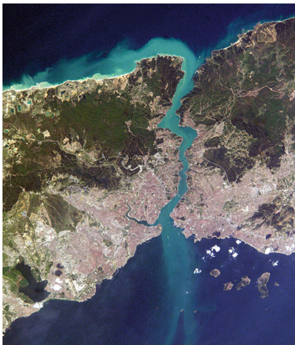
Bosporus and Istanbul: View from space (NASA, 2004) ( http://ru.wikipedia.org/wiki/Bosphorus )

Subsequently, the name came to denote a “narrow strait” in general and be used with an appropriate attribute: in Herodot’s writings (fifth century B.C.) the strait is called Bosphorus Frakian. The existing Turkish names: Bogazichi (“Internal Strait”), Istanbul-Bogazi (“Istanbul Strait”), Karadeniz-Bogazi (“Black Sea Strait”), Marmara-Bogazi (“Strait of Marmara Sea”) failed to gain popularity: in some countries, the name of “Bospor” is accepted; in Russia, France and Poland the form “Bospor” has been in common use. Length 30 km, width from 0.7 to 3.7 km. Mean depth—65 m, maximum depth—120 m. The depth of the port on the side overlooking the Black Sea—up to 59 m, on the side overlooking the Sea of Marmara—up to 40 m. B. shores are high, steep, picturesque, with numerous bays. Many fitting natural harbors, the best of which is Golden Horn near the European coast, close to the exit to the Sea of Marmara.