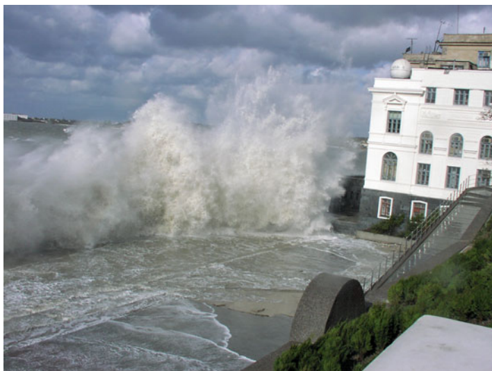
Heavy storm in Sevastopol on 11 November 2007

Subject to the nature of winds, considerable wave develops during the autumn-winter season in the north-western, north-eastern and central parts of the sea. Prevalent waves are 0.5–1 m high, but in open water areas maximum height of the wave during very strong storms may be as high as 10 m. The most still are southern areas of the sea, where strong wave is rare, and waves higher than 3 m are hardly ever observed.