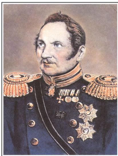
Bellingsgauzen F.F. ( http://www.navy.su/persons/02/images/bellingsgauzen_ff_00.jpg )

In 1826, B. headed a group of ships that cruised in the Mediterranean Sea near the coasts of Turkey. From 1827—commander of a guards crew with which he arrived in the active army at the start of the 1828–1829 Russian-Turkish War; flying his own flag on the ship “Parmen”, participated in the siege and seizure of the Turkish fortress Varna. In 1830–1831, cruised near the coasts of Kurlandia (Latvia). From 1839—commander of Kronstadt Port and military governor of Kronstadt. Under his guidance, new port facilities were built and the old facilities and forts were remodeled, the steamer works were built, a hospital was opened, much was done to provide urban amenities. From 1843—B. is also a member of the Admiralty Council. A sea in the Pacific Ocean, cape in South Sakhalin, an island in the Tuamotu Archipelago, an island in the Aral Sea, a depression in the Pacific Ocean, and other locations are named after B. There is a monument to B. in Kronstadt, and a memorial bust to him in Nikolaev.