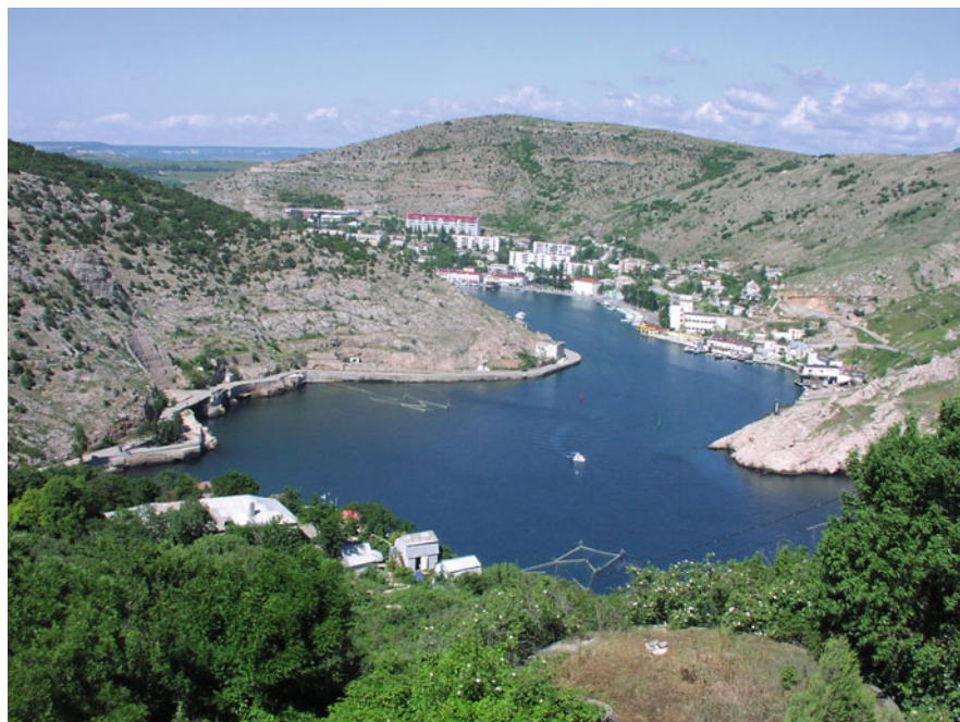
Balaklava harbor: View on the entrance to the harbor

symbols as well as bight (harbor) of Istrigons figures in Homer's "Odyssey". A winding, cozy, picturesque bight, concealed between precipitous rocky mountains and unseen from the Black Sea with which it is linked by a narrow, winding passage. The bight is about 1,500 m long, its width ranging from 200 to 400 m. Before the twentieth century, the bight was famous for its abundance of gray mullet and mackerel. The bight is the suite of Balaklava town.