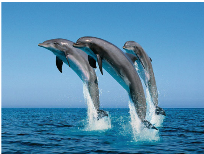
Bottlenose dolphin ( http://true-wildlife.blogspot.ru/2011/02/bottlenose-dolphin.html )

Bozkurt – a town on the coast of the Black Sea, Turkey.