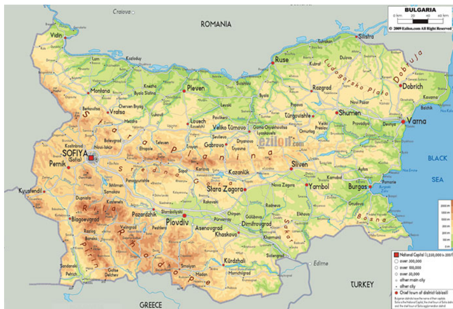
Bulgaria. Physical map ( http://www.ezilon.com/maps/images/europe/Bulgaria-physical-map.gif )

economic system. It includes 27 provinces and a metropolitan capital province (Sofia-Grad). All areas take their names from their respective capital cities. The provinces subdivide into 264 municipalities.