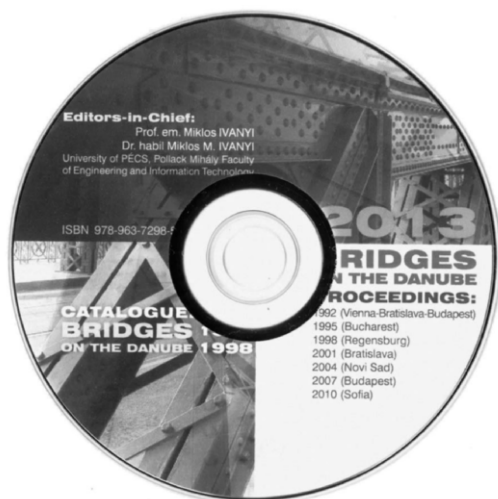
Figure 3: Danube Bridges Conferences Proceedings (1992 – 2010) and the Danube Bridges Catalogue

The next Danube Bridges Conference will be organized by Slovakia in 2016.