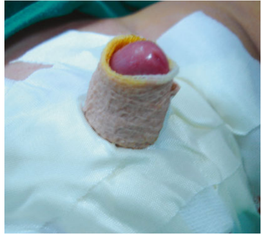
Fig. 2.42 Penile lymphedema responding well after circumcision

Initial management involves observation. If lymphedema remains significant or progresses, then surgical therapy is necessary. The goal of surgical treatment is to remove all involved tissue. On the penile shaft, the penis is degloved and all tissue between Buck's fascia and the skin must be excised, as well as redundant penile skin. If the scrotum is involved, all scrotal tissue, with the exception of the skin, testes, and spermatic cords, must be removed. Usually most of the scrotal skin must be excised, with the exception of the posterior skin. The penis may be covered