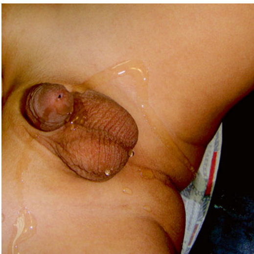
Fig. 2.19 Abnormally deviated urinary stream

The intraoperative technique of artificial erection using a normal saline solution is critical to the procedure's success. An alternative is to inject alprostadil, 14\text{ }\mu\text{g} , into the corpora intraoperatively while manually compressing the corporal base. This technique allows tumescence throughout the penile repair. Detumescence is induced by infiltrating the corporal bodies with phenylephrine, 40\text{ }\mu\text{g} . During correction, one must be careful to avoid injury to the neurovascular bundles [26, 27]. Repair of dorsal penile deviation is performed by excising ellipses from the ventral corporal bodies.