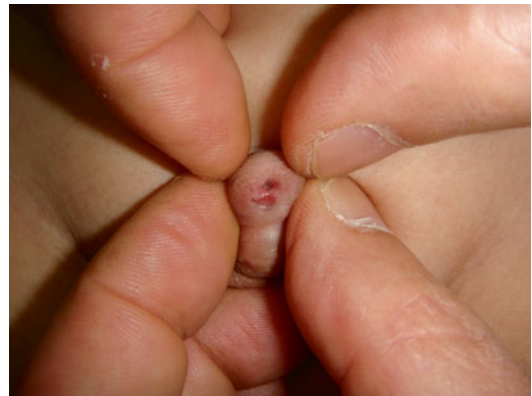
Fig. 2.54 Meatal duplication without hypospadias