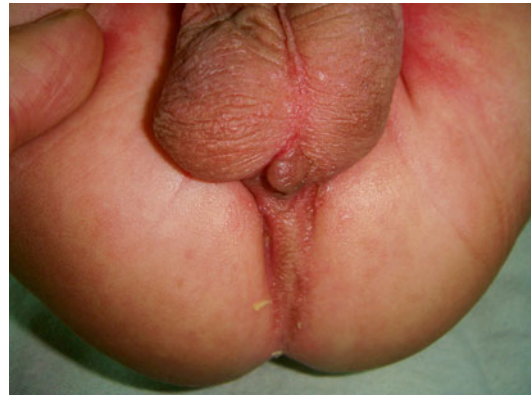
Fig. 2.27 Major incomplete PST with hypospadias

affected; this explains the frequent occurrence of the other genital abnormalities (Fig. 2.27).