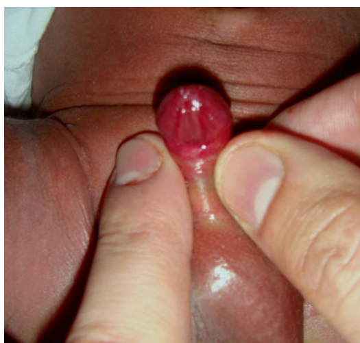
Fig. 2.48 Intact sound prepuce harboring megameatus

contrary to the classical presentation of most hypospadias, but also because of the technical shortcomings that are encountered during repair with standard techniques. There are several differences between MIP and typical distal hypospadias. Obviously, MIP by definition is associated with a completely formed prepuce in contrast to the ventrally deficient foreskin in other cases of hypospadias. Furthermore, the meatus is abundantly large in the MIP variant, whereas many boys with distal hypospadias have a rather small-appearing meatus. Ventral curvature is much less likely to occur in a patient with MIP than in those with other varieties of distal hypospadias.