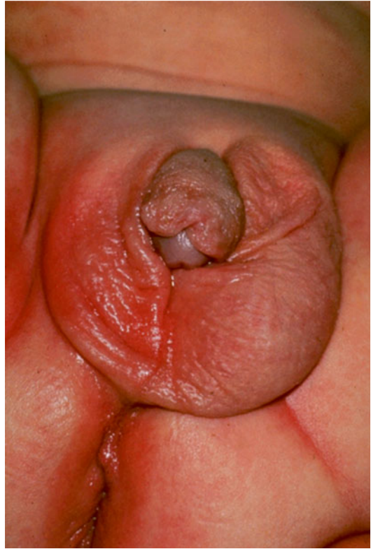
Fig. 2.28 Minor unilateral PST

PST is a rare heterogeneous anomaly, the detection of which should warrant careful clinical evaluation to rule out other anomalies, especially of the urinary system, gastrointestinal tract, upper limbs, craniofacial region, and central nervous system. PST may be a localized field defect involving the genitourinary system with major renal anomalies which include complete agenesis of the urinary system, unilateral or bilateral renal agenesis, polycystic or dysplastic kidneys, horseshoe kidney, ectopic pelvic kidney, and obstructive uropathy. Genital abnormalities include a disproportionately long flaccid penis, complete urethral atresia, and hypospadias.