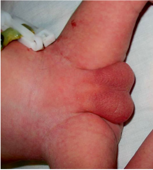
Fig. 2.3 Aphallia without urethral opening

survive with such anomaly; however, penile agenesis may be a localized malformation of the genital tubercle potentially related to penoscrotal transposition. Reports indicate that aphallia may be associated with pregnancy complicated by poorly controlled maternal diabetes [4].