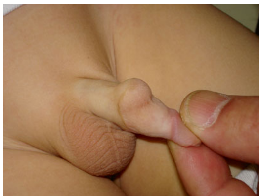
Fig. 2.43 Penile cyst