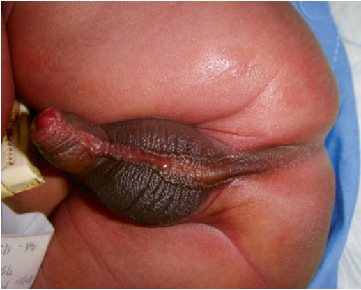
Fig. 2.36 Widely separated median raphe