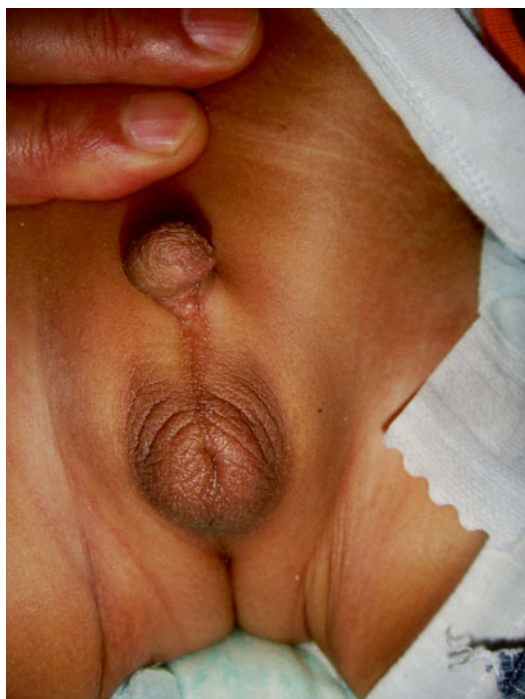
Fig. 2.30 Wide penoscrotal distance (caudal scrotal regression)