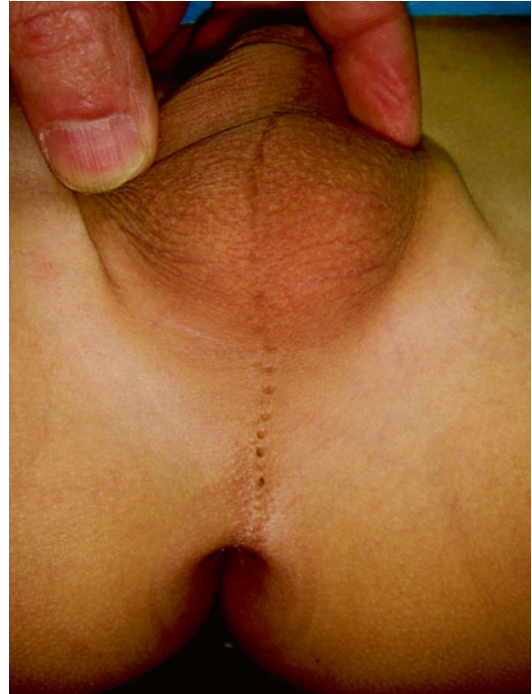
Fig. 2.38 Beaded median raphe

Penile lymphedema (Fig. 2.40) is an uncomfortable and potentially disfiguring disorder. It may be congenitally inherited (15 %), in either an autosomal dominant form (Milroy's disease), a sporadic form (in 85 % of the cases) that occurs at puberty (Meigs' disease), or