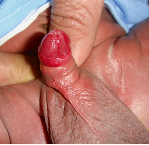
Fig. 2.32 Short contracted median raphe