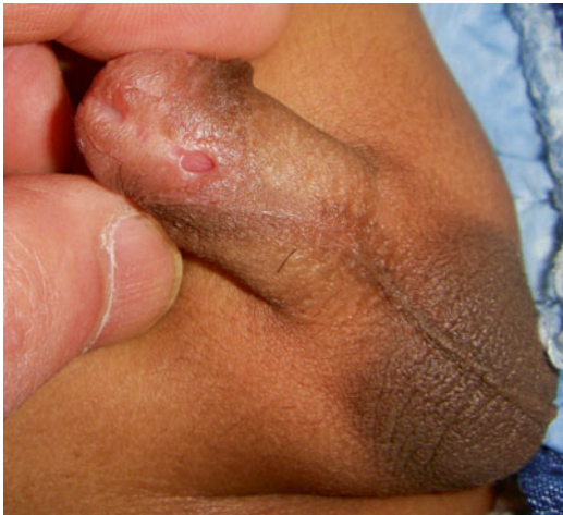
Fig. 2.33 Deviated median raphe with hypospadias