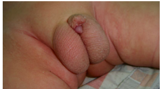
Fig. 2.7 Microphallus with normal testicles

ical and psychological problems similar to those of the major intersex form. The scrotum usually is normal (Fig. 2.7), but sometimes the testes are small or undescended, or the scrotum may migrate cephalically engulfing the small phallus as a minimal scrotal transposition (Fig. 2.8). In a few cases, the corpora cavernosa are severely hypoplastic, and it is not rare to have microphallus with severe hypospadias and deficient corpus spongiosum (Fig. 2.9).