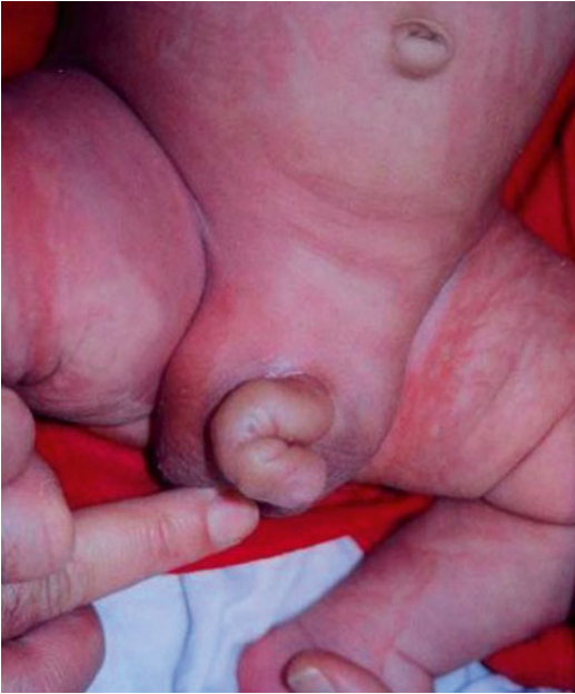
Fig. 2.40 Penile lymphedema