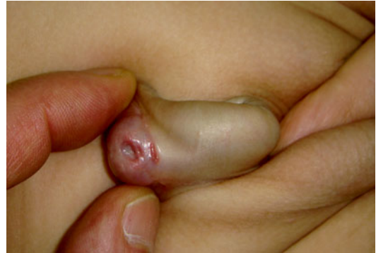
Fig. 2.53 Duplicated meatus with hypospadias

It is a common finding with different grades of hypospadias (Fig. 2.53), but many cases are reported without any other anomalies; giving more attention to such finding may help more in reporting.