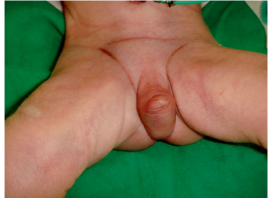
Fig. 2.4 Aphallia with absent testicles and only skin covering the urethral opening

More than 50 % of patients with penile agenesis have associated genitourinary anomalies, the most common of which is cryptorchidism, renal agenesis, and dysplasia. Cardiovascular gastrointestinal defects, such as caudal axis anomalies, also have been described. Skoog and Belman [5] reviewed 60 reports of aphallia and found that the more proximal the urethral meatus, the greater the likelihood of neonatal death and the higher the incidence of other anomalies. Sixty percent of patients had a postsphincteric meatus located on a peculiar appendage at the anal verge. This group of patients had the highest survival rate (87 %) and the lowest incidence of other anomalies (1.2 per patient). Twenty-eight percent of patients had presphincteric urethral communications (prostatorectal fistula), and there was a 36 % neonatal mortality rate. Twelve percent had urethral atresia and a vesicorectal fistula for drainage. This group had the highest incidence of