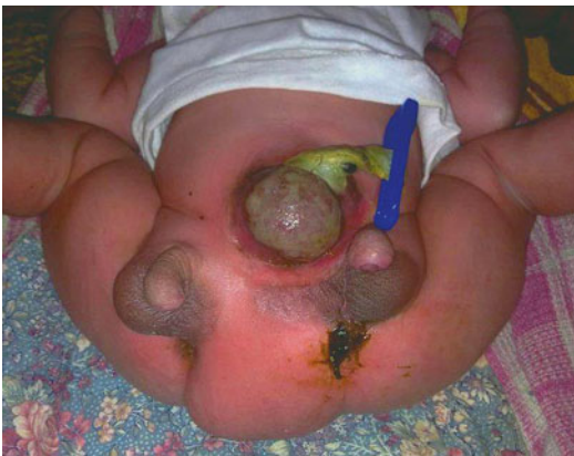
Fig. 2.15 Complete diphallia with two phalli and two anal openings and exomphalos