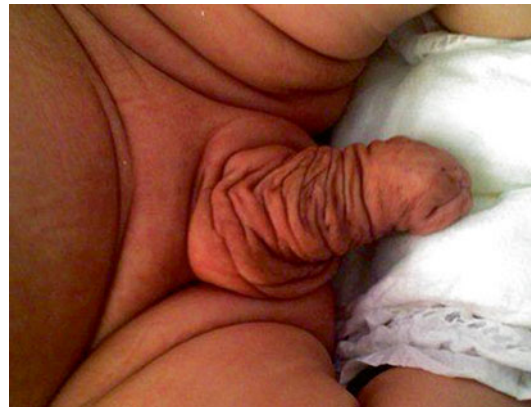
Fig. 2.10 Isolated megalopenis

Isolated cases of macropenis in a normal baby and without any associated anomalies are extremely rare (Fig. 2.10), but macropenis could be noticed in other congenital penile or urethral anomalies which will be discussed later on like congenital megalourethra (Fig. 2.11) and congenital penile lymphedema (Fig. 2.12); in those