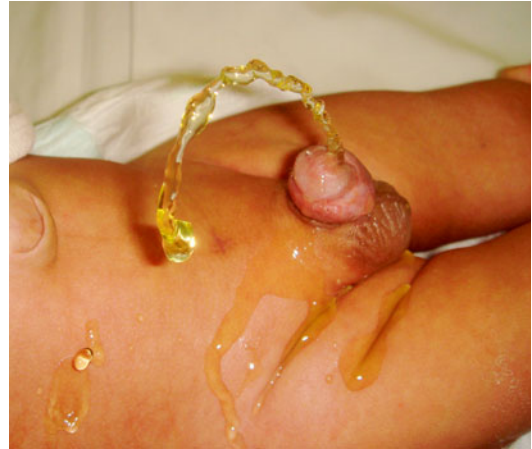
Fig. 2.51 Dorsally diverted stream with meatal stenosis