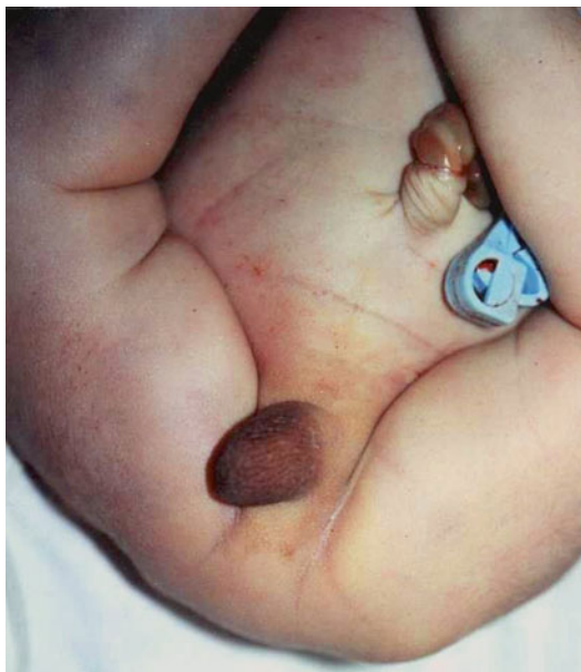
Fig. 2.5 Aphallia with partial caudal regression, no anal opening, and a hump of skin replacing the phallus