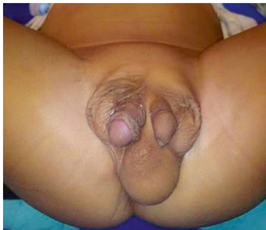
Fig. 2.13 Complete diphallia with two urethral openings and two scrotums

The first reported case of PD was reported by Johannes Jacob Wecker in 1609 [21]. Penile duplication is a normal finding in some animal species, male snakes and lizards, each possessing a pair of penis-like organs.