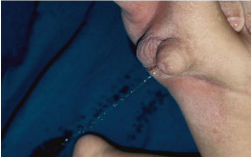
Fig. 2.49 Postcircumcision meatal stenosis