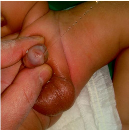
Fig. 2.50 Congenital meatal stenosis with fine stream

Symptoms of meatal stenosis vary with the appearance, in most cases; meatal stenosis does not become apparent until after the child is toilet trained. If the meatus is pinpoint, the boy voids with a forceful, fine stream that has a great casting distance (Fig. 2.50). Some boys have a dorsally deflected stream or a prolonged voiding time (Fig. 2.51). Dysuria, frequency, terminal hematuria, and incontinence are symptoms that may lead to discovery of meatal stenosis but generally are not attributable to this abnormality.