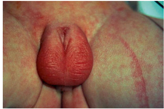
Fig. 2.1 Complete aphallia with normal scrotum and testicles

The urethra opens at any point of the perineal midline from over the pubis to, most frequently, the anus or anterior wall of the rectum. In Fig. 2.3, no urethral opening could be appreciated.