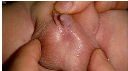
Fig. 2.9 Microphallus with corpus spongiosum deficiency and hypospadias