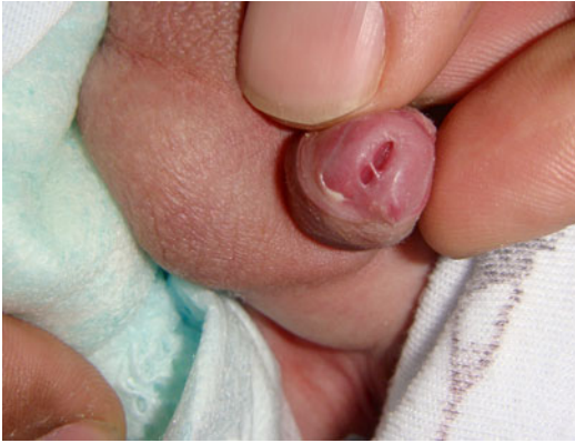
Fig. 2.55 Thin septum between the two meatus