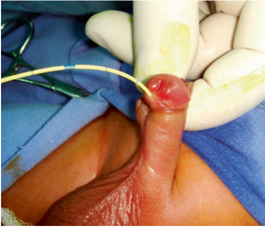
Fig. 2.52 Stenotic meatus admitting only a size 4 French ureteral catheter

tions are not effective in treating meatal stenosis due to high rates of recurrence. Thus, surgical meatotomy is the treatment of choice.