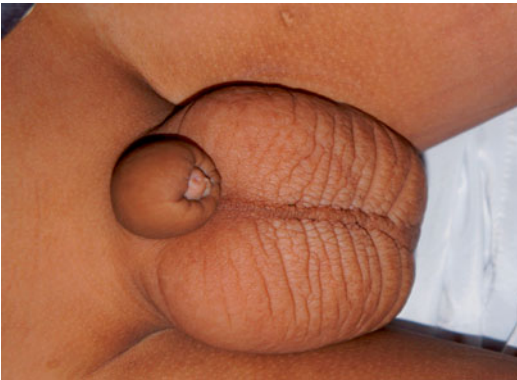
Fig. 2.41 Scrotal lymphedema