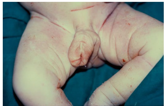
Fig. 2.11 Megalopenis in congenital megalourethra