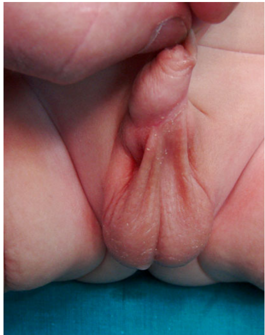
Fig. 2.29 Central penile scrotalization