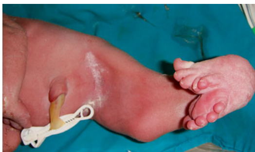
Fig. 2.6 Aphallia in association with sirenomelia

with low mortality and fewer additional malformations [6].