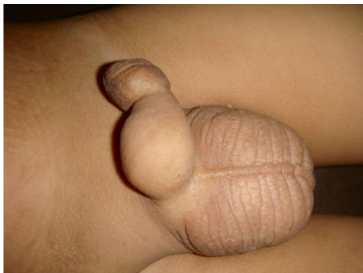
Fig. 2.12 Megalopenis in congenital lymphedema

conditions the penile gigantism is not a true one. Megalopenis should be also differentiated from megaprepuce or macroposthia which also will be discussed in Chap. 3.