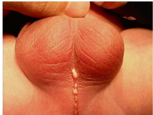
Fig. 2.39 Pearly penile papules in the median raphe

usually caused by acquired infection, e.g., lymphogranuloma venereum or filarial infestation, with Wuchereria bancrofti . Scrotal elephantiasis (Fig. 2.41) is extremely rare outside endemic regions in Africa and India [45]. Lymphedema of the genitalia is characterized by impaired lymphatic drainage caused by obstruction, aplasia, or hypoplasia of lymphatic vessels that causes progressive penile and/or scrotal swelling.