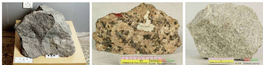
Fig. 2.4 Basalt ( left ), coarse-grained granite ( middle ), and medium-grained granite ( right )