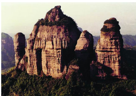
Fig. 2.3 Sandstone in Shaoguan, Guangdong Province

Granite is the most common igneous rock. It is not extrusive rock but a kind of acid rock. Granite is generated by long time cooling of magma from volcano bottom to crater during the process of volcanic eruption. According to the length of cooling time, different sizes of macroscopic crystalline particles sequentially formed from volcano bottom to crater are called fine, medium, coarse-grained granite, respectively.