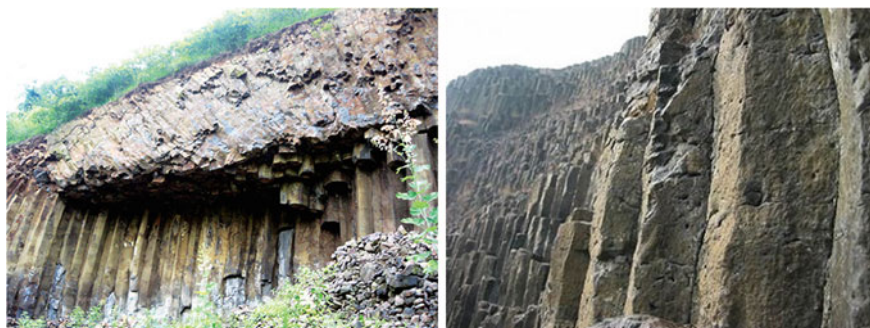
Fig. 2.5 Basalt in Zhangzhou, Fujian Province

have visible pores, such as Haikou of Hainan Province. Basalt in most parts of China has the characteristics of high density and low water absorption.