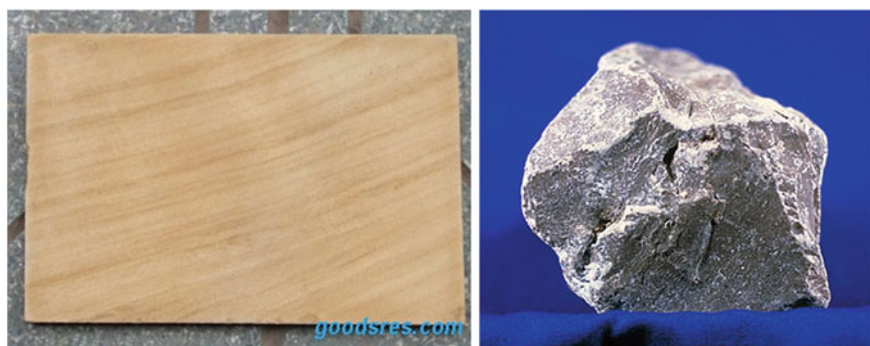
Fig. 2.2 Sandstone ( left ) and limestone ( right )