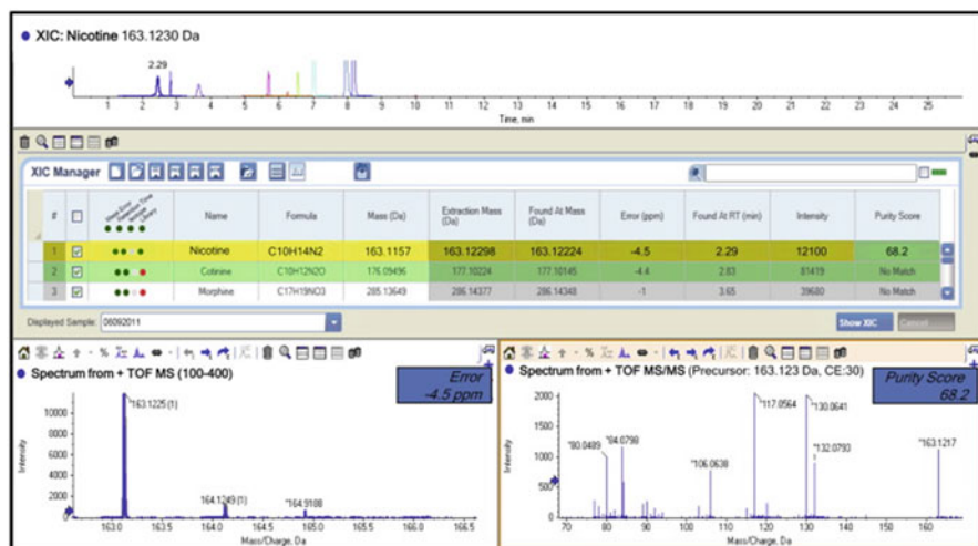
Fig. 1 Example of identification of the targeted compound nicotine in a river water sample based on accurate mass MS and MS/MS information (from Panditi et al. [46])

The use of internal standards (IS) also reduces matrix effects since the analyte-to-internal standard response ratio compensates for any ion suppression/enhancement that may be present. Use of isotopically labelled internal standards (ILIS) is the most recognized technique. Panditi et al. [49] report signal suppression/enhancement values lower than 20% in most cases in the LC-MS/MS analysis of 31 antibiotics in reclaimed water. Ibañez et al. [50] also report the use of ILIS to evaluate the efficiency of ozone treatment in the removal of a set of pharmaceuticals and drugs of abuse. A detailed study of matrix effects in wastewater samples [5] also highlight the use of ILIS, demonstrating that the selection of an analogue eluting at close retention time did not always ensure adequate correction.