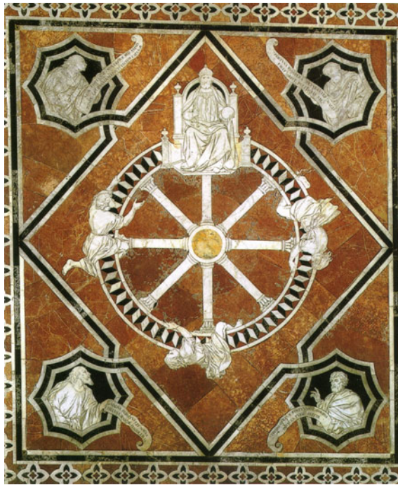
Fig. 1 Fortuna (1372) depicted on the floor of the Cathedral of Siena. Is the ruler on his throne ( regno ) about to fall ( regnavi ), or is he rather, solidly enthroned, supervising the ascent and descent of the other figures? Strikingly enough, the four philosophers in the corners are all pagan: Euripides (“I have told you, son, to seek fortune through labours,” from Elektra ); Seneca (“A great fortune is a great slavery,” from De consolatione ); Aristotle (“Great fortune makes men more petulant,” from the Politics ); and Epictetus (“Glory not in the gifts of fortune, but in the goods of the souls,” from the Enchiridion ). Their advice has no providential, Christian, or eschatological overtones, but combines classical prudentialism with the topos of virtus vincit fortunam (“virtue/determination wins over fortune”): don’t seek fortune, but if you do, seek it through hard labour; but be beware that it will negatively affect your character; and anyway, “it’s what’s inside that counts.”