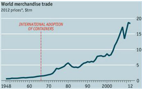
Table 2.1 Growth of shipping from 1970 to 2012