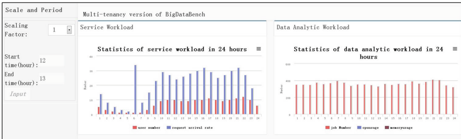
Fig. 4. System demonstration screenshots: Step 2

Step 2. Selection of benchmarking period and scale. At this step, users have the option to select the period and scale for their benchmarking scenarios. To facilitate this selection, BigDataBench-MT shows the statistic information of both the service workload (including its number of requests and end users per second) and the data analysis workloads (including their number of jobs and average CPU, memory resource usages) at each of the 24 hs. Suppose users select the benchmarking period of 12:00 to 13:00 and the scale factor is 1 (that is, no scaling is needed). The workload traces belonging to this period are selected for step 3.