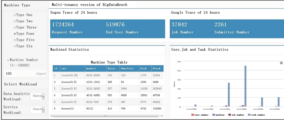
Fig. 3. System demonstration screenshots: step 1

Step 2. Selection of benchmarking period and scale. At this step, users have the option to select the period and scale for their benchmarking scenarios. To facilitate this selection, BigDataBench-MT shows the statistic information of both the service workload (including its number of requests and end users per second) and the data analysis workloads (including their number of jobs and average CPU, memory resource usages) at each of the 24 hs. Suppose users select the benchmarking period of 12:00 to 13:00 and the scale factor is 1 (that is, no scaling is needed). The workload traces belonging to this period are selected for step 3.