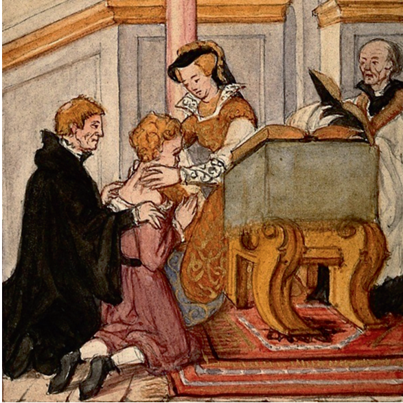
Fig. 2.13 Queen Mary I of England “healing” scrofula (tuberculosis of the neck) by touch ( http://commons.wikimedia.org/wiki/File:Mary_I_touching_for_scrofula_(crop).jpg )

garis (literally, the common wolf) is a term for disease of the skin, and tabes mesenterica is TB of the abdomen. A special type of skin TB is “prosector’s wart,” indicating that pathologists and anatomists occasionally contracted the disease from contaminated cadavers.