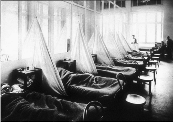
Fig. 2.11 US Army Camp Hospital No. 45, Aix-Les-Bains, France, Influenza Ward No. 1, during World War I, circa 1918

By May, the Germans were within artillery range of Paris. For them, victory seemed to require only a swift and decisive attack.