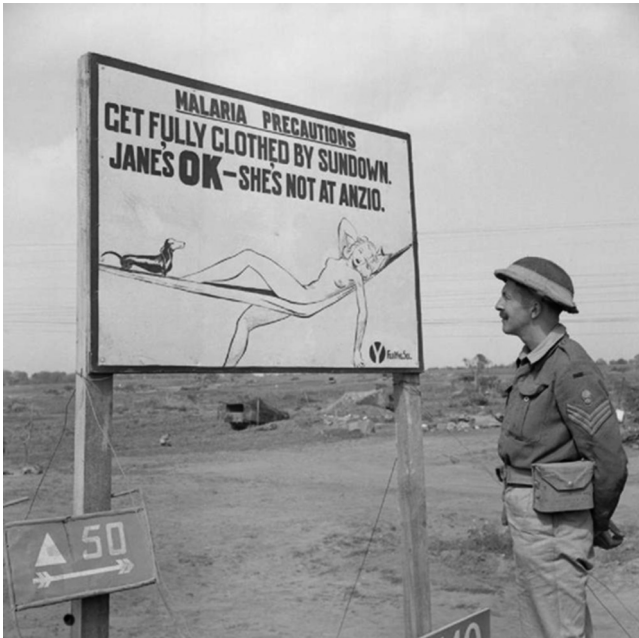
Fig. 2.8 A malaria warning sign at Anzio during World War II, advising troops to cover up in the evening to avoid mosquito bites, 10 May 1944 ( http://commons.wikimedia.org/wiki/File:A_malaria_warning_sign_on_the_Anzio_front_in_Italy_advising_troops_to_cover_up_in_the_evening_to_avoid_mosquito_bites,_10_May_1944._NA14700.jpg )

Today, more than 300 million people worldwide are infected with the malaria parasite, and up to 1–3 million die annually. The disease is most prevalent in sub-Saharan Africa, and most deaths are in children under age 5. Statistics are imprecise, at best, because most malaria cases and most deaths are undocumented.