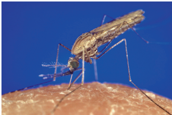
Fig. 2.6 Anopheles mosquito feeding.

Malaria has exerted a selective, Darwinian influence on the incidence of genetic diseases. One manifestation of this impact is in relation to sickle cell anemia. An autosomal dominant inherited disease, sickle cell anemia is caused by a mutation of the HBB gene related to a hemoglobin subunit. The abnormality affects some 2.5 million people in the United States, about 8–10 % of the country’s African-American population, and also occurs in some non-black persons. A minority of those affected are homozygous for the sickle cell gene; these people have sickle cell disease and