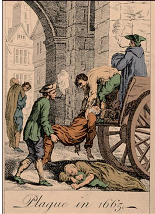
Fig. 2.3 The Great Plague of London in 1665, the last major outbreak of bubonic plague in England ( http://commons.wikimedia.org/wiki/File:Great_plague_of_london-1665.jpg )

In 1630, plague broke out in Venice and then spread north, eventually reaching the Tyrol and the Bavarian village of Oberammergau. Through a rigidly enforced quarantine, the residents of the small village escaped much—but not all—of the plague’s devastation. In desperation, the villagers vowed that, if God would deliver them from the plague, they would present a play depicting the life and death of Jesus every decade to symbolize their gratitude. Today, you can visit the Passionsspielhaus in the village (as I did in 1958), and once every 10 years, you can see the Oberammergau Passion Play (Major, 1936, p. 33).