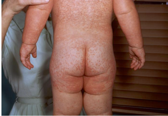
Fig. 2.14 The rash of measles

But when the virus is introduced into an immunologically naive population, the results can be disastrous. Virtually everyone in the Fijian population contracted the disease. Affected persons sought relief from high fevers by immersion in the ocean. Some of those who contracted the disease survived to enjoy future immunity. Eventually, up to 40 % of the native Fijian population died. From Fiji, the disease spread from island to island in the South Pacific, in each instance recreating the picture of suffering and death.