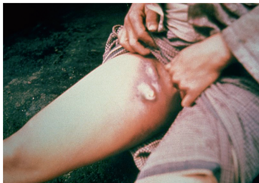
Fig. 2.1 A swollen, ruptured inguinal lymph node, the bubo ( http://commons.wikimedia.org/wiki/File:Plague_-buboes.jpg )

First, a short review of microbiology: Bubonic plague refers to the “bubo”—an enlarged lymph node, most noticeable in the groin area (see Fig. 2.1). The caus-