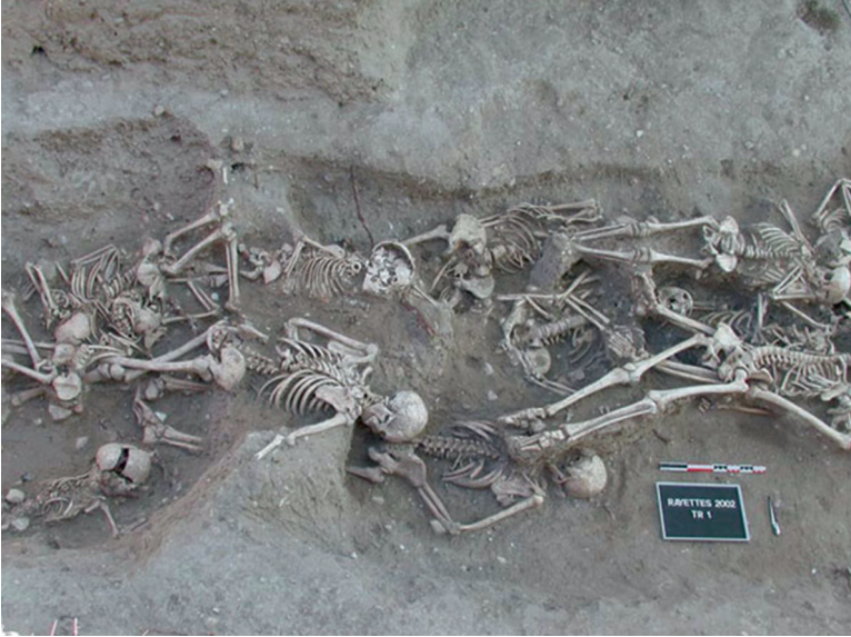
Fig. 2.2 Bubonic plague victims in a mass grave in Martigues, France