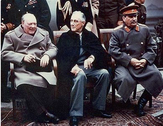
Fig. 2.15 Roosevelt with Churchill and Stalin at Yalta, 1945. Note the cigarette in Roosevelt's left hand ( http://commons.wikimedia.org/wiki/File:Yalta_Conference_cropped.jpg )

On April 12, 1945, just two months after the Yalta Conference, Roosevelt died of a cerebral hemorrhage. His personal physician reported that the fatal stroke had come “out of the clear sky” [10].