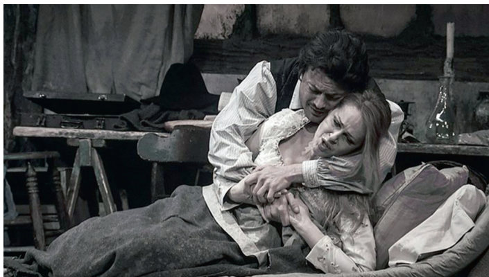
Fig. 2.12 La Bohème from the Metropolitan Opera April 2014.