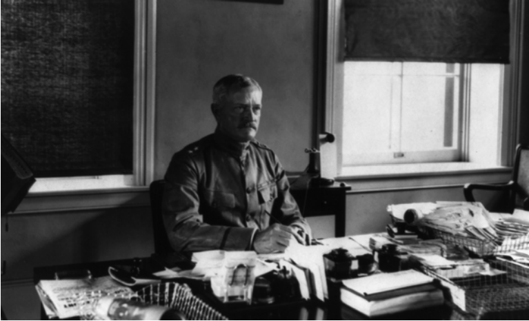
Fig. 2.1 General John J. Pershing in 1917

26th National Guard Division (the “Yankee” Division) sailed for France in September, as did the 42nd “Rainbow” Division. By March 1918, there were 318,000 American soldiers in France (Keegan 1999, p. 372). By April 1918, there were seven of the oversized American divisions in France, the equivalent of 14 British, French, or German divisions. The number would have been higher if not for the lack of transport ships to get the troops across the Atlantic. In February the British agreed to release a large number of transport ships for use by the Americans, and the number of American troops shipped to France accelerated. By June 1918 the number of American troops topped 650,000, and new troops were arriving at a rate of nearly 10,000 per day (Eisenhower 2001, p. 99). By August 1918, 1,300,000 men had arrived, and more were arriving at a rate of over 250,000 per month (Keegan 1999, p. 373). By November 1918, there were 42 American divisions in France, plus men in the Services of Supply bringing the total enlisted strength of the US ground forces to over 4 million, of whom 3 million were in France and the rest being trained in the United States.