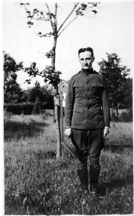
Fig. 2.3 Lt. William F. Friedman in 1918