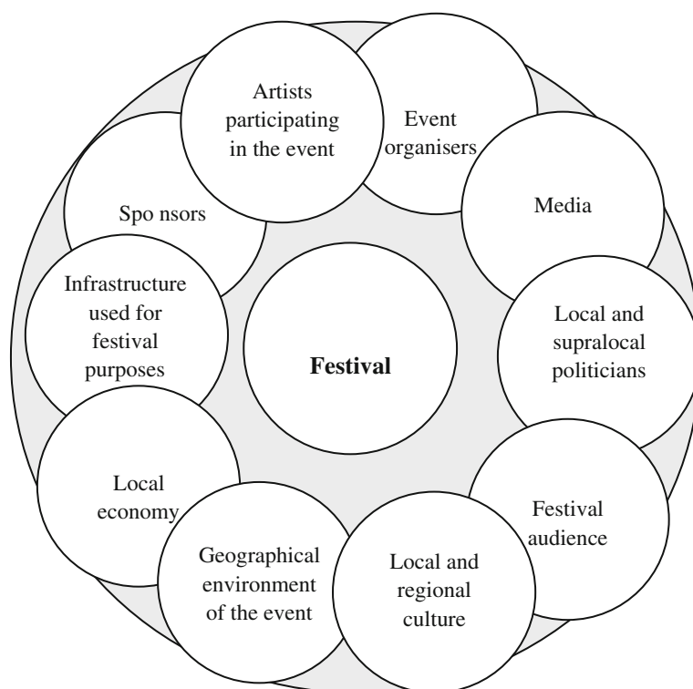
Fig. 2.2 Elements of the festival environment. Source Own elaboration on the basis of Hauptfleisch (2007, p. 43)

journalists, etc.). It is important to present the festival in the contexts of the social network theory and the obligatory points of passage (or convergence), which are elements of such networks. They are particular points of social and business contacts and a part of more extensive relational links within the social network of a given community. The social network theory has a long tradition. It is based on the assumption that there are various links among different actors in a society, which form functional and spatial systems within the social space. Such networks include relationships between the persons who create them and institutions. These relationships are very important because social networks enable their participants to maintain personal and virtual contacts, to exchange information and ideas, or to cooperate creatively on specific projects (Wasserman and Faust 1994).