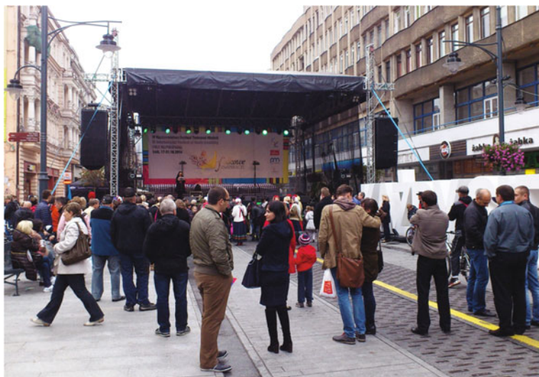
Fig. 2.1 The main street of Łódź (Piotrkowska Street) during a street festival in 2014.

As for the organisation of a festival event, it takes place at a specially designated place and time, is a public celebration and has a leading theme. A festival is an event based on extraordinary experiences (e.g. cultural) which during an event occupies specified place for a specified period of time. Moreover, a festival can be either a one-off or a regular event and may include a competition. As for the other