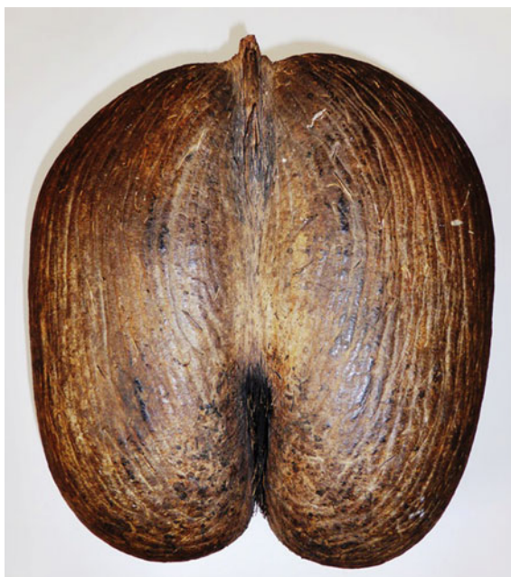
Fig. 3 Image of a coconut of Lodoicea maldivica

There are still many examples which oblige us to act in order to preserve all species without distinction, because, as it has already been mentioned, not all species are sufficiently studied.