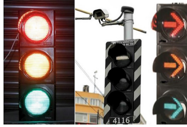
Fig. 3. LED based lamps produced by ISBAK Inc at Istanbul city.