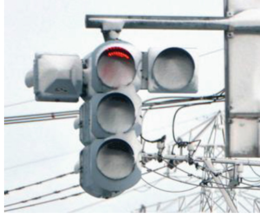
Fig. 5. Heavy snow conditions cover the LED based traffic lamps.

green-house gas emissions would be prevented equivalent to 3139 automobiles withdrawn from traffic.