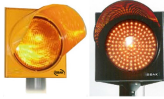
Fig. 1. The yellow incandescent bulbs and LED based lamps produced by ISBAK Inc. (Color figure online)