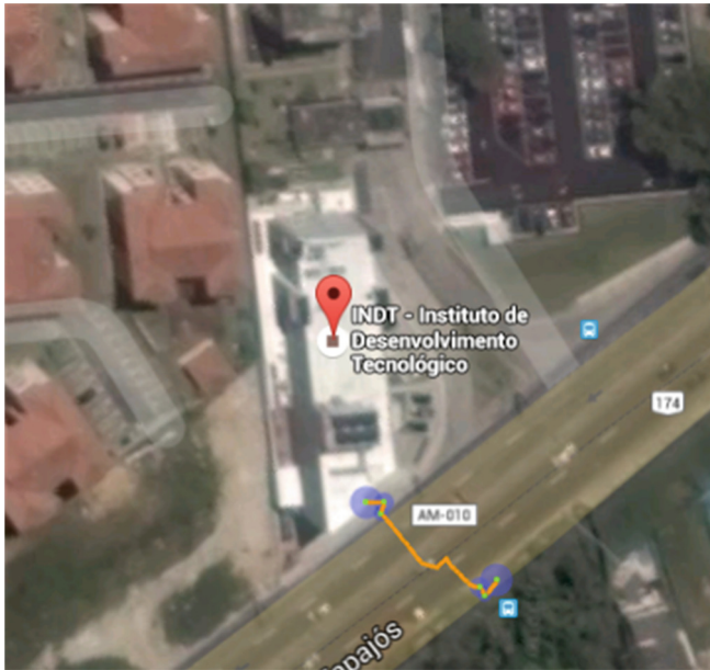
Fig. 3. Path of user during test. Circle size shows amount of stationary time. Clicking on each circle will show user context and emotional feedback (Fig. 4).

To test negative feedback, we asked one male adult (32 years old) to login to one of his social networks accounts and post one line of text to his timeline. During this task, we turned the WLAN connection on and off, in intervals of 30 s. After 5 min of not being able to execute a considerably simple task, the test subject was noticeably disappointed. The emotional feedback logged by our system was in successful accordance to the test session.