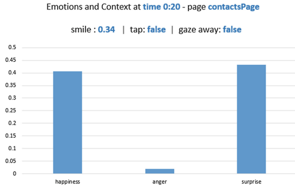
Fig. 4. Emotions and context information at given time

To test positive feedback, we asked one male adult (27 years old) to answer a quiz of charades and funny answers. The emotional feedback logged by our system was successful, as the user smiled and even laugh about the funny text and imagery.