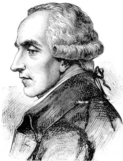
Fig. 2.1 French mathematician Pierre-Simon Laplace (1749–1827), author of ‘ Mécanique Céleste ’, which inspired Mary Somerville to write her first book “On the Mechanism of the Heavens”

popular repute as chief attorney to Queen Caroline and proposer of educational reforms in Parliament that pioneered several innovations, most of which were concerned with making scientific education more readily available to the working classes. Moreover he was one of the founders of University College in London, and in 1825, of the Society for the Diffusion of Useful Knowledge, which would become Mary’s lifetime employer.