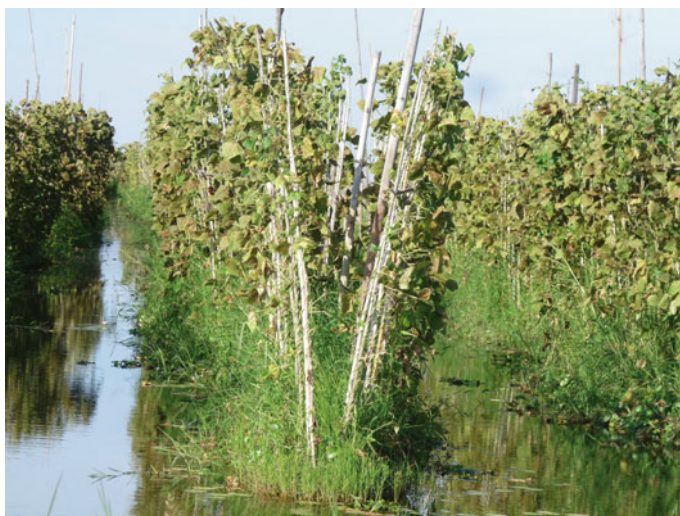
Fig. 2.5 Vegetable gardening adapted to a flood zone, Inle Lake, Burma

Regarding the drought risk in agriculture, these concepts could be applied when seeking to reduce crop vulnerability by using varieties or cropping systems that are less vulnerable to drought, such as conservation agriculture, rather than trying to reduce hazards by expensive irrigation investments requiring more water, a locally rare resource. Public funding should also be directed towards vulnerability management rather than investing in hazards reduction.