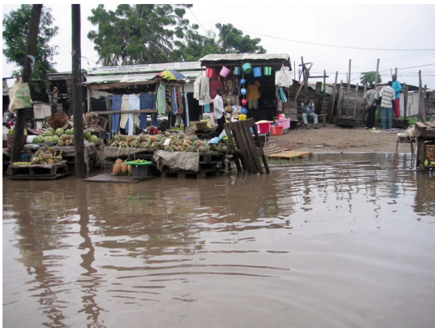
Fig. 2.3 Market near a flooded road after heavy rain, Cameroon

Support measures could be effectively identified by focusing studies on enhancing vulnerability assessment and management. This could help gain further insight into the risk, to come up with non-structural solutions that do not involve infrastructures and that indirectly boost the efficiency of structural measures, while drawing up land use plans that take all of these risk factors into account (Figs. 2.2 and 2.3).