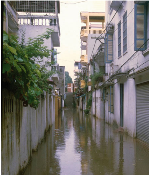
Fig. 2.1 Flooded street, Hanoi