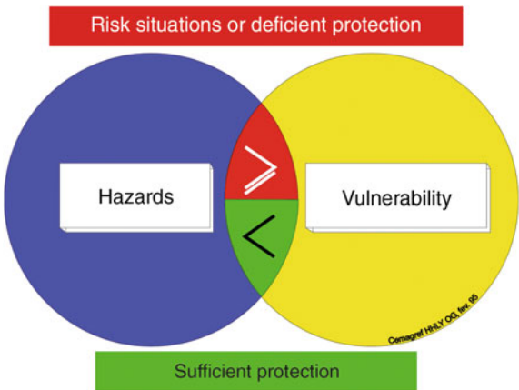
Fig. 2.2 Risk—a combination of hazards and vulnerability (Gilard 1998a, b). In red , unacceptable risk situations when hazards are greater than the vulnerability and, in green , acceptable risk situations when hazards are less than the vulnerability. This comparison may be made for each territorial unit