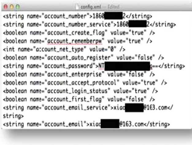
Fig. 3 The password is stored unencrypted in Android system

schedule management, directly to Google’s cloud platform. At the same time, in Android system customized by a third party, it is possible that there are other data will be synchronized to an external system.