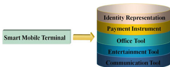
Fig. 1 Development trend of smart mobile terminals

operation in application programs), the PC-class processing power, the high-speed access capabilities and the rich interactive interface, including the smart mobile phones and the tablet computers. The mainstream operating system platforms include two categories—Android and iOS on the market.