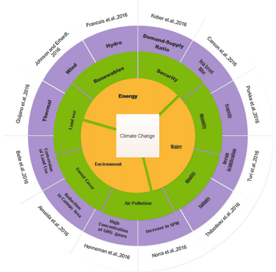
Fig. 2.1 Figure showing the impacts of climate change

The Inter-governmental Panel on Climate Change (IPCC) was established to work about the impact of climate change. The Panel has simulated the future scenario based on the change in climatic pattern, socio-economic stability and increase in urban population.