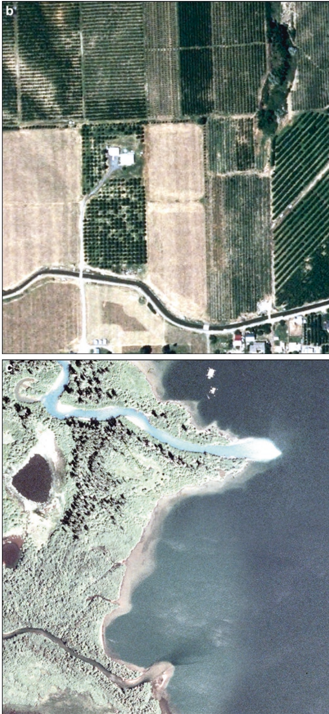
Figure 2.1 (continued) (b) Agricultural type (hay field vs. orchards) (1:5000). Orchards are indicated with their dark green, regularly spaced tree crowns. Hay fields are beige with a smooth texture. (c) Sediment loads and relative depth in aquatic environments (1:10,000)