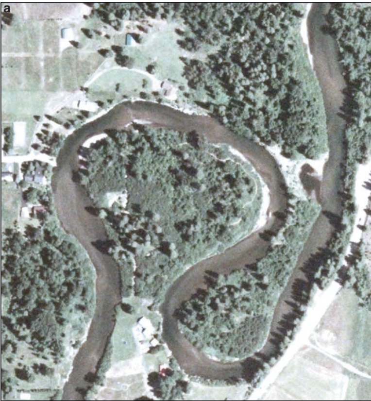
Figure 2.1 Examples of landscape features distinguishable from fine scale aerial photography. Shown is an area from Washington State, USA in 2006. More details can be found in Tomlinson et al. 2011 who contrasted this imagery with similar locations in 1949 to examine changes in fish habitat. (a) Sinuosity (curvature) of rivers and the extent of riparian zones (1:5000)

Aerial photographs are captured with an airborne camera and represent the reflectance (or relative brightness) of features on the ground. Aerial photographs are often acquired along a flightline (i.e., a path flown in a constant direction over a targeted area). A critical component of collection along flightlines is that adjacent