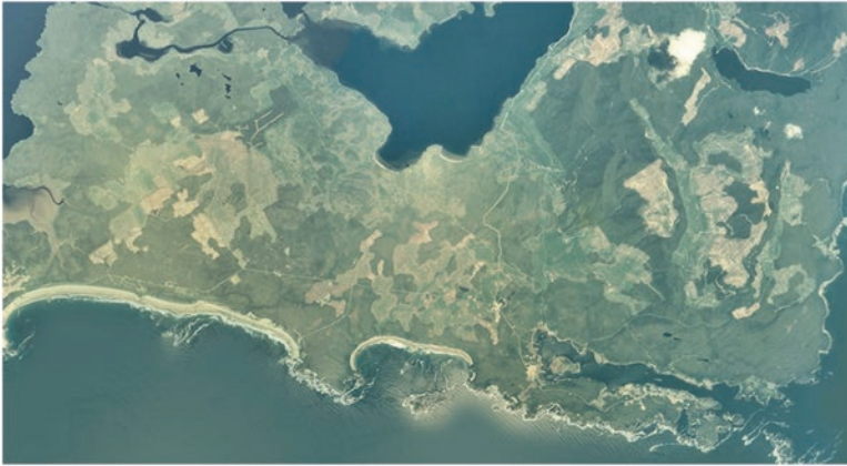
Figure 2.3 Regional view of the Clayoquot Sound landscape near Tofino and Ucluelet, British Columbia, surrounding the smaller area you will be examining with more recent (1990s) and historical (1930s) photographs. Here, an orthophoto has been created demonstrating landscape condition in the 70s/80s

Working as small teams (or groups of two) you will start by classifying the contemporary (circa 1996) photographs of the Kennedy Lake, British Columbia using the categories described in Table 2.2 and Figure 2.4. The area of this modern orthomosaic is 6.85 km 2 . Read the series of steps (1–6) below, before you begin.