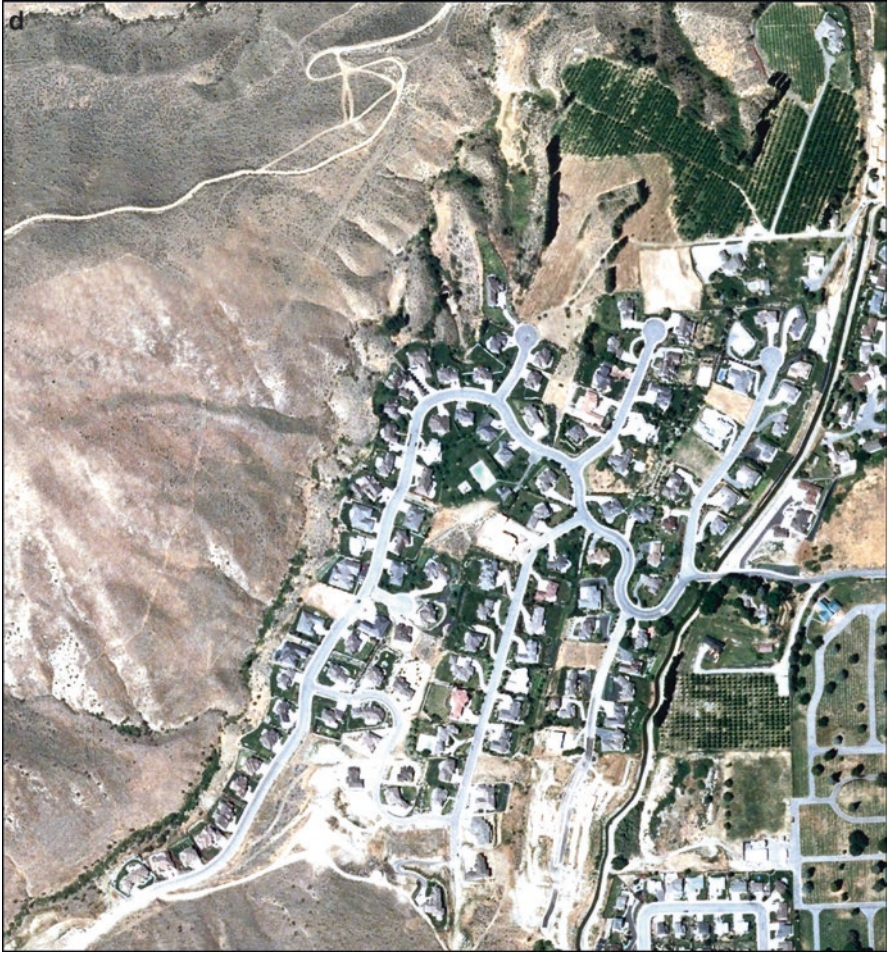
Figure 2.1 (continued) (d) Urban-wildland interface and urban density (number of houses or roads in an area) (1:10,000)

photographs possess some degree of spatial overlap (often up to 60%). This overlap presents the landscape from two different viewpoints, and thus can be used to view various features in 3-dimensions. Any two adjacent photographs with overlap are referred to as photo pairs or stereo pairs and are most easily viewed in 3-D with the aid of a stereoscope.