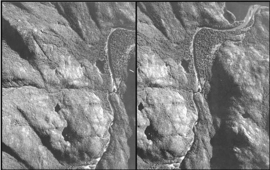
Figure 2.2 Stereo pair from coastal British Columbia captured in 1937. A printable version is available from the book website in the StereoPairs folder (see Site 1 )