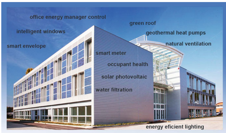
Fig. 2.8 Virtual environments and ICT Centre, Marco Sala Associati