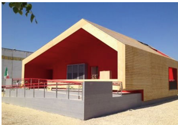
Fig. 2.9 Virtual Environments and ICT Centre, Lucca