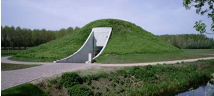
Fig. 2.2 Environmental building, Netherlands

transferrable to other climate areas without specific adaptation. Taking into account the previously mentioned assessment efforts and considering the significant case studies, we will focus on the knowledge transfer of residential Passivhaus experiences to residential NZEB retrofitting in different climatic areas. Climate-adapted retrofitting solutions are based on smart retrofitting solutions; the articulation of knowledge transfer is based on three main factors: