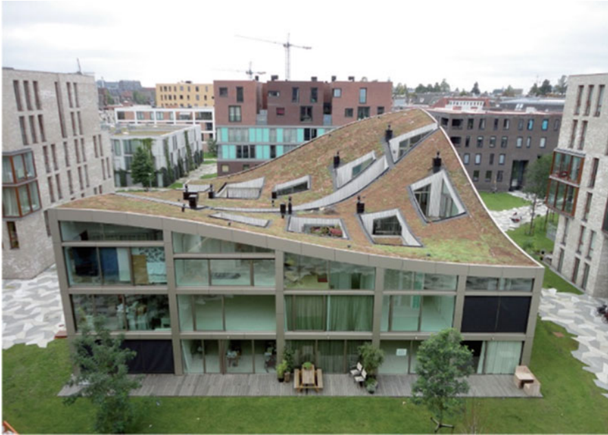
Fig. 2.3 Funen Blok, Amsterdam, NL Architecten