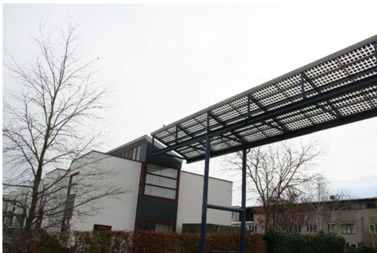
Fig. 2.6 PV integration in Amersfoort, Newland, Netherlands. Photovoltaic roof integration, Foster & Partners