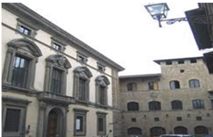
Fig. 2.4 Bardini Museum refurbishment (EULEB)