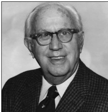
Fig. 2.1 Stacy Rufus Guild, PhD (1890–1966) (from Bordley JE. Ann Otol Rhinol Laryngol 1966)

In 1941, during the American Association of Anatomists meeting in Chicago, Guild SR [7, 8] (Fig. 2.1) had rediscovered the nonchromaffin paraganglioma of the jugular bulb and described the glomus tissue as an ovoid body flattened in the adventitia