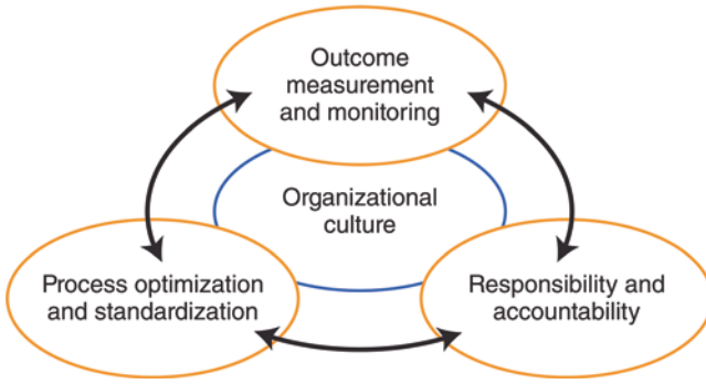
Fig. 1 High-reliability organizations and their organizational culture*

that appreciates the relationships among a variety of organizational and technical risk factors and their effects on patient harm and procedural inefficiency. This concept (Fig. 1) underscores the central role of creating an organizational culture of safety that enables improving surgical safety and quality and providing high value surgical care. This requires that clinicians acknowledge their primary responsibility to care for patients and their families as well as to manage processes for optimization, standardization, and continuous measuring and monitoring of outcomes.