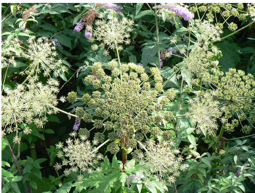
Photograph: Massive flower-heads of giant hogweed are another Victorian garden import, this time from the Caucasus