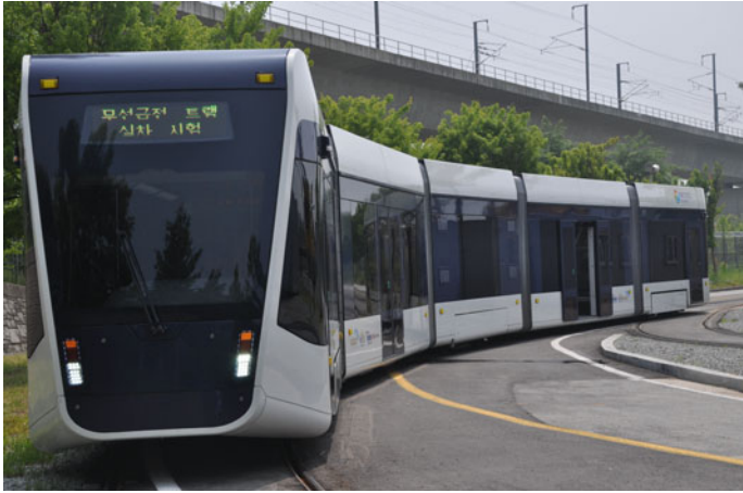
Fig. 2.5 SMFIR-based tram tested in Korea (90 kHz power supply)