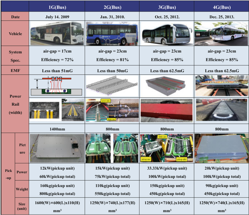
Fig. 2.2 Four generations of OLEV

OLEV’s first test of its SMFIR system in 2009 was the first successful demonstration of a wireless power system for electric vehicles in motion. The OLEV system has so far been deployed at four sites in Korea. The OLEV tram system originally installed in Seoul’s Grand Park as a pilot project in late 2009–early 2010 has been running as a commercial service since 2011, replacing a noisy and smelly diesel system. It travels on a 2.2 km circular path around the park, powered by an underground power supply system totaling 372.5 m in four segments (Fig. 2.3). In 2012, OLEV buses serviced the international exhibition Expo 2012 in Yeosu. Since 2012, two OLEV buses have been transporting students, staff, and faculty around the KAIST campus in Daejeon. In August 2013, OLEV was also installed in Gumi, an important industrial city in Korea with a population of 350,000. The thirty-five kilometer route is serviced by six buses and powered by six charging pads under the road (Fig. 2.4). Gumi added two more OLEV buses to its system in May 2016. The latest to install an OLEV system is Sejong, a newly developed city that houses many central government offices.