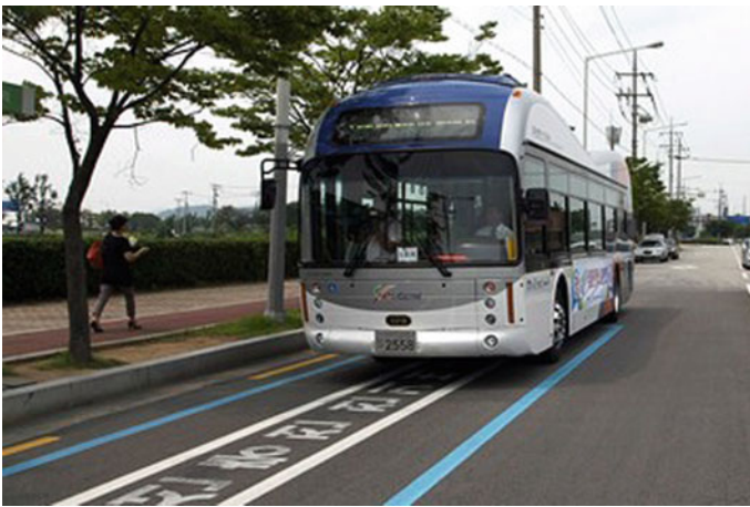
Fig. 2.4 OLEV bus in Gumi. The blue lines indicate the location of the underground power supply cables

One exciting prospect arising from this technology is high-speed trains equipped with SMFIR. Europe has had high-speed electric trains for three decades, Japan for only somewhat less. Korea also has a high-speed electric train that is the primary mode of transport between major cities; the electricity cost of transporting a passenger on these high-speed trains from Seoul to Busan (about 200 miles) is extremely low. China has been building high-speed train-systems throughout the country, which may be a good investment in the long term. (Although the United States, for political reasons, has not yet been able to build high-speed railways, sooner or later it will end up building them—albeit at greater cost than necessary owing to the delay.) In Korea, KAIST and the Korea Railroad Research Institute