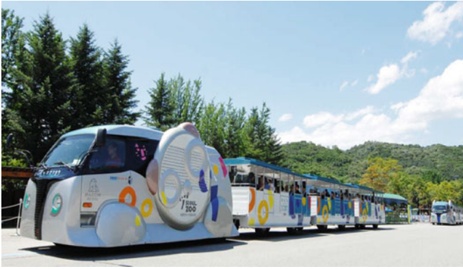
Fig. 2.3 OLEV tram installed in Seoul's Grand Park