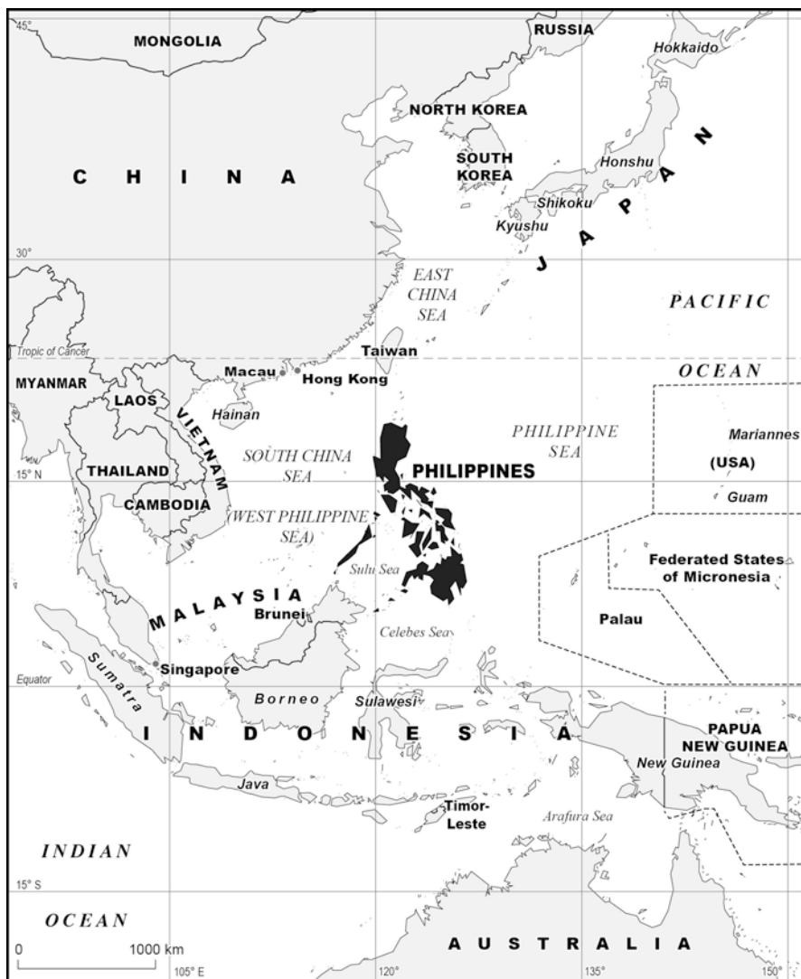
Fig. 2.1 The Philippines in Southeast Asia

7107 islands, but only 11 of them cover 94% of the land area, two of them, Luzon in the north (104,687 km 2 , 35%) and Mindanao in the south (94,630 km 2 , 32.6%), being each larger than the rest of the archipelago, where the central islands, around the central Visayan Sea, are called collectively the Visayas.