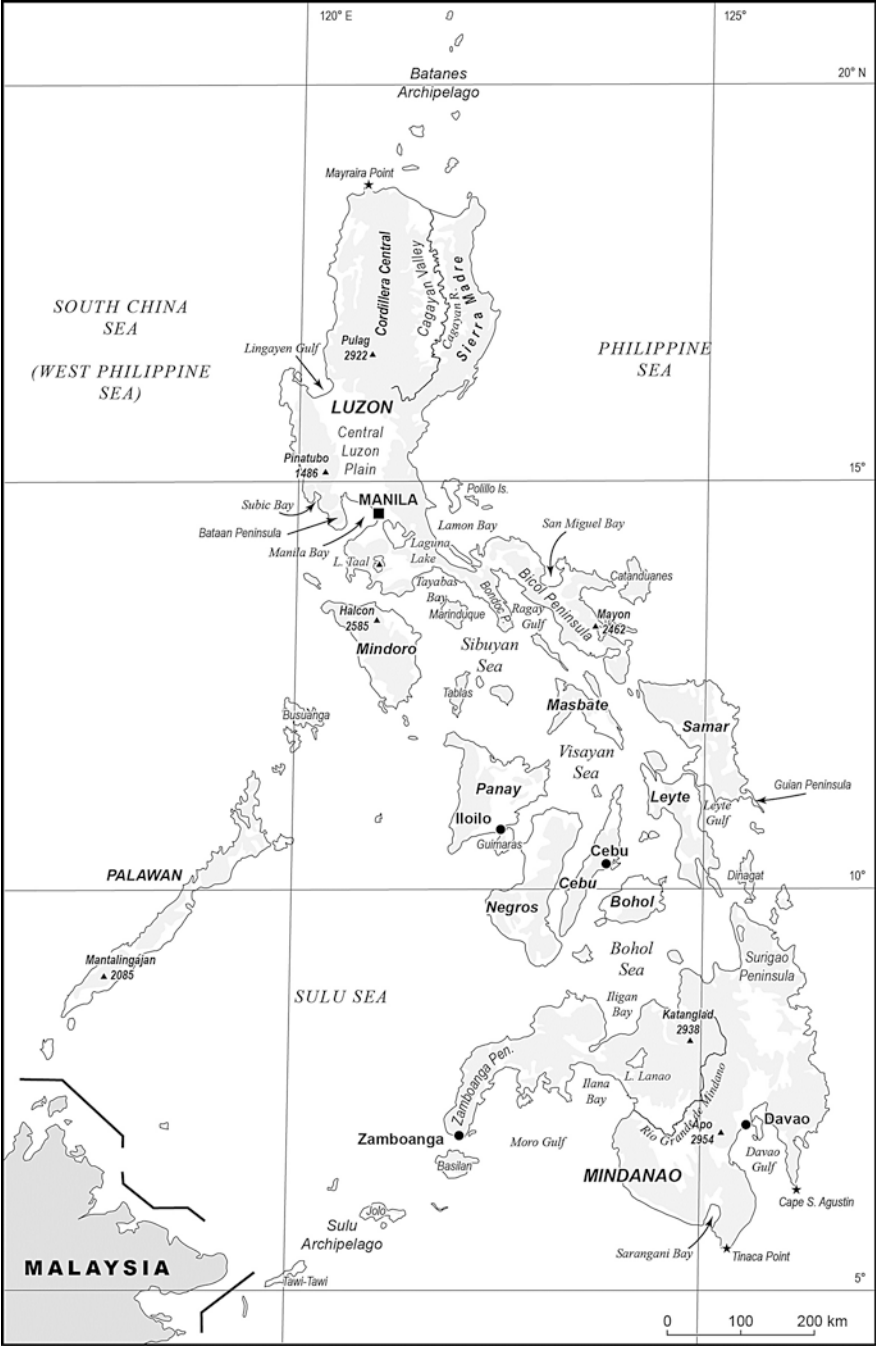
Fig. 2.4 Principal features of the physiography of the Philippines